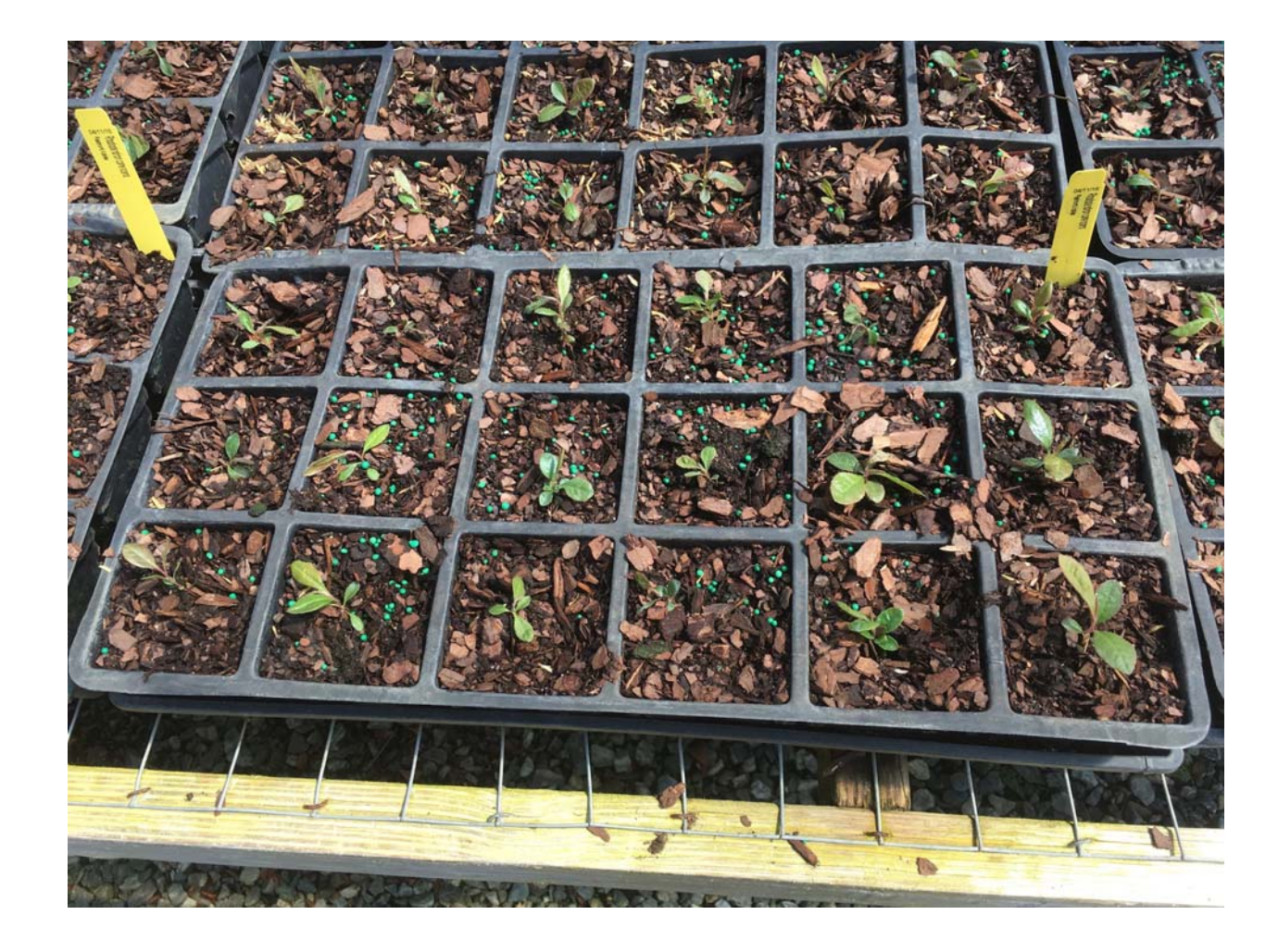
Figure 4. Freshly transplanted Rhododendron canescens seedlings, April 1, 2018