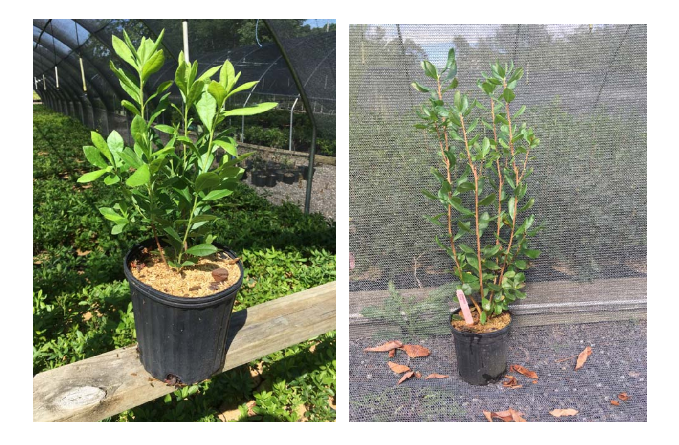
Figure 8. Growth of 1-gal Rhododendron atlanticum on June 6 (left) and September 28 (right); seedlings were transplanted on March 22, 2018.