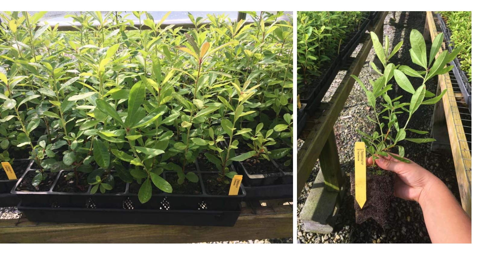
Figure 6. Rhododendron austrinum liners, Sept 4, 2018. Transplanted on April 20, 2018.