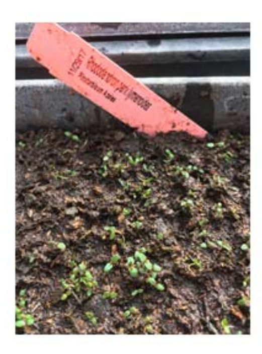
Figure 2. Rhododendron periclymenoides seedlings in flats in early January.