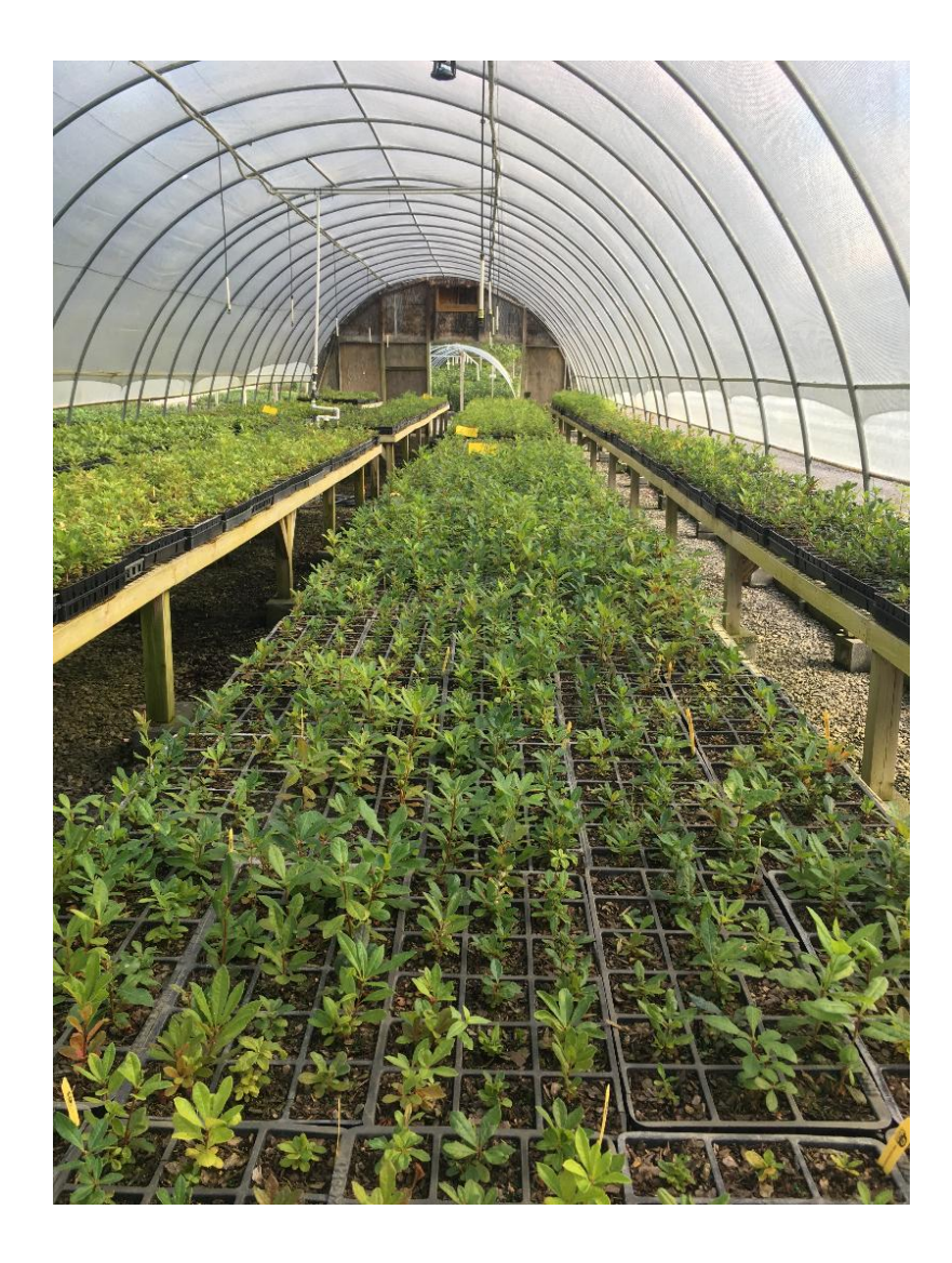
Figure 5. Azalea liners in propagation house, September 2018.