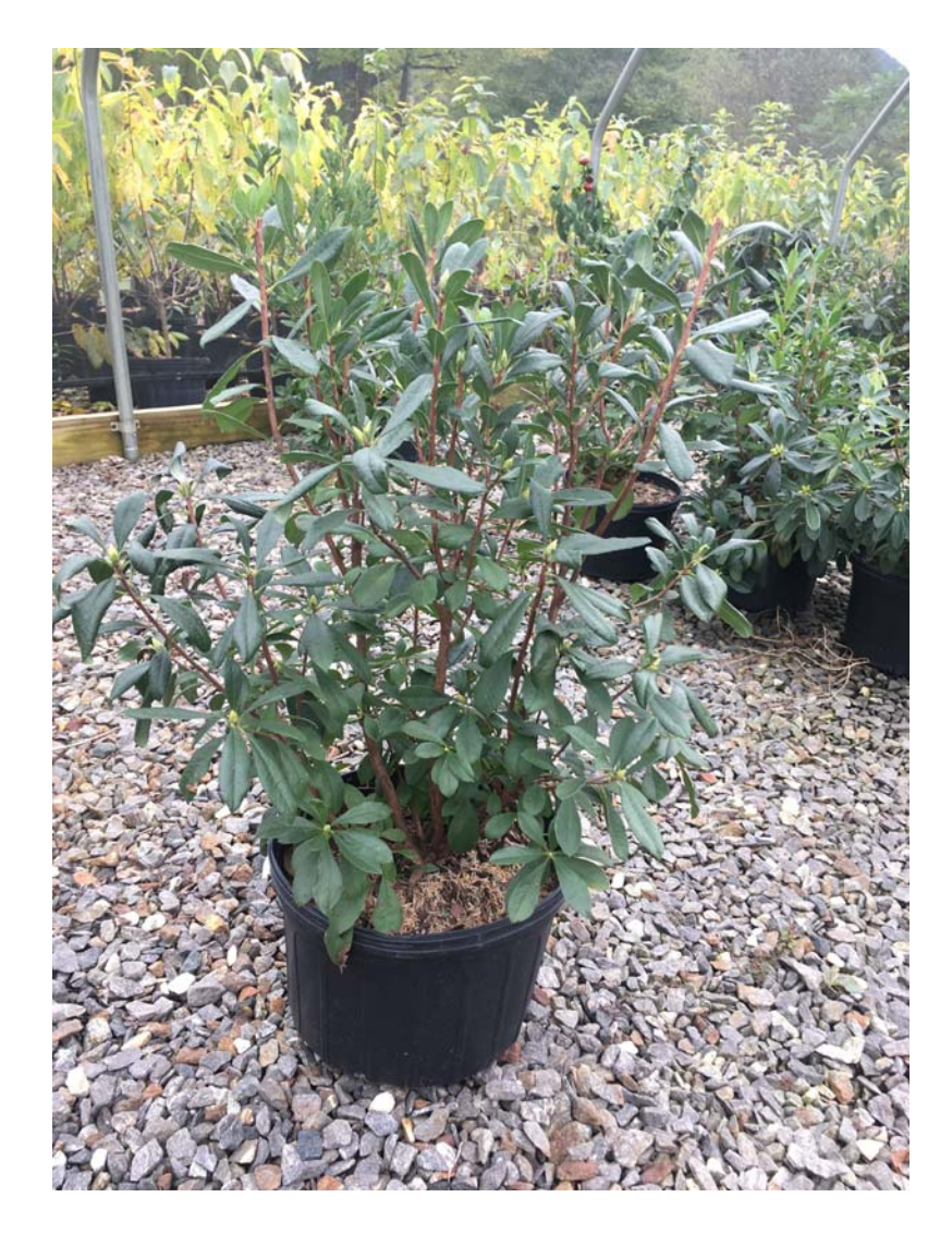
Figure 9. Growth of 3-gal Rhododendron atlanticum on 26 September 2018; seedlings were transplanted on 15 March 2018.