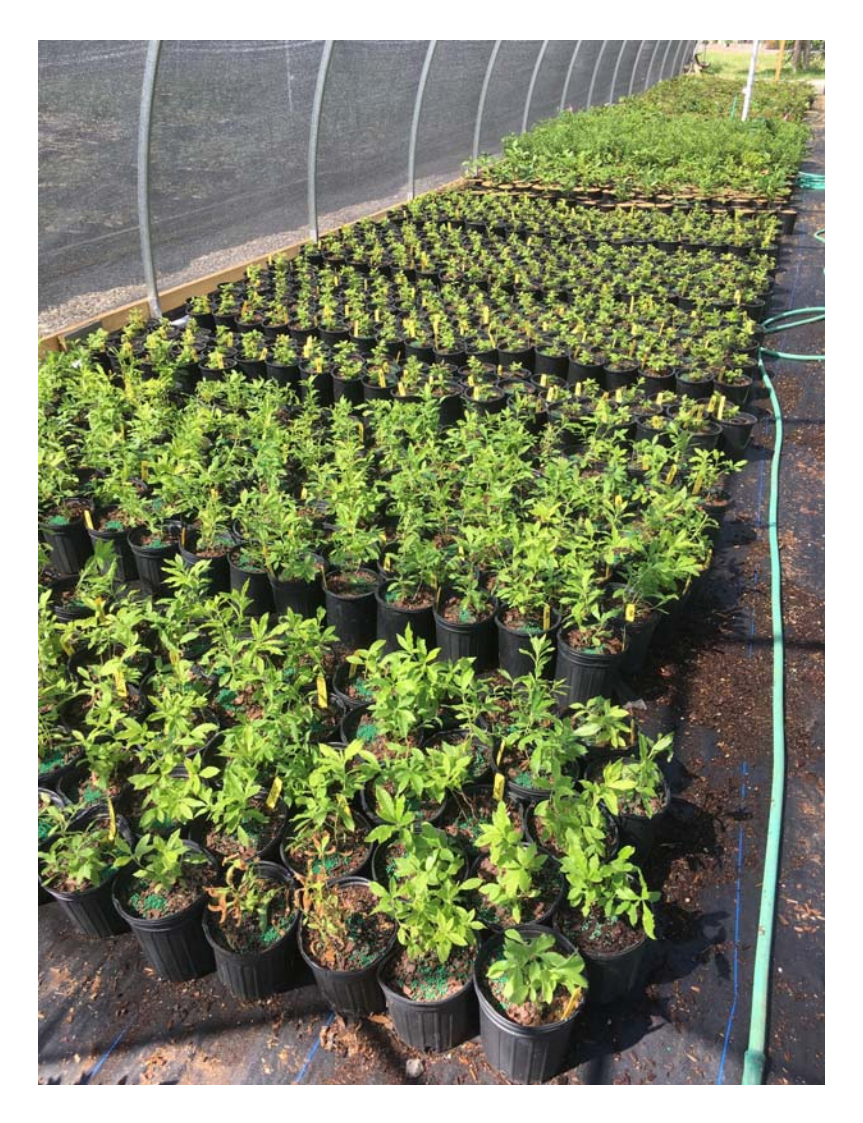
Figure 7. Bed of 1-gal Rhododendron atlanticum , June 12 2018. Seedlings were transplanted March 22 2018.