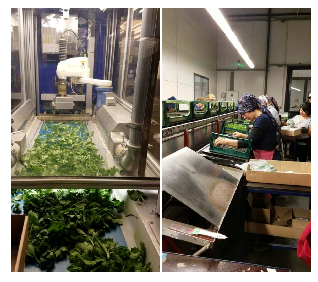
Figure 11. A robot and women workers sticking cuttings at Deliflor Chrysanthemum