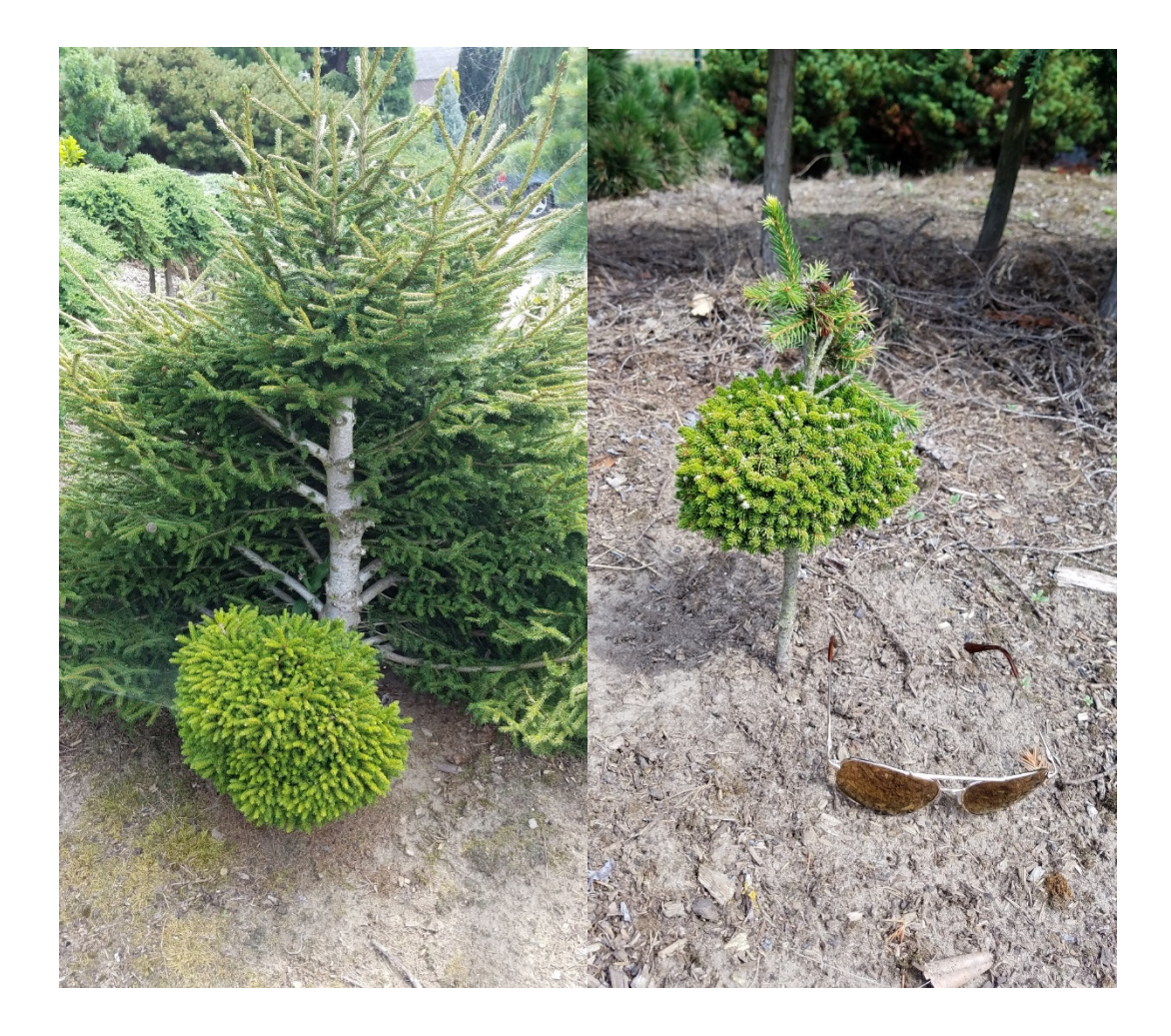
Figure 6. A witch's broom on a conifer at Piet Vergeldt Boomkwekerij, and a photo of a miniature conifer grafted from that witch's broom.