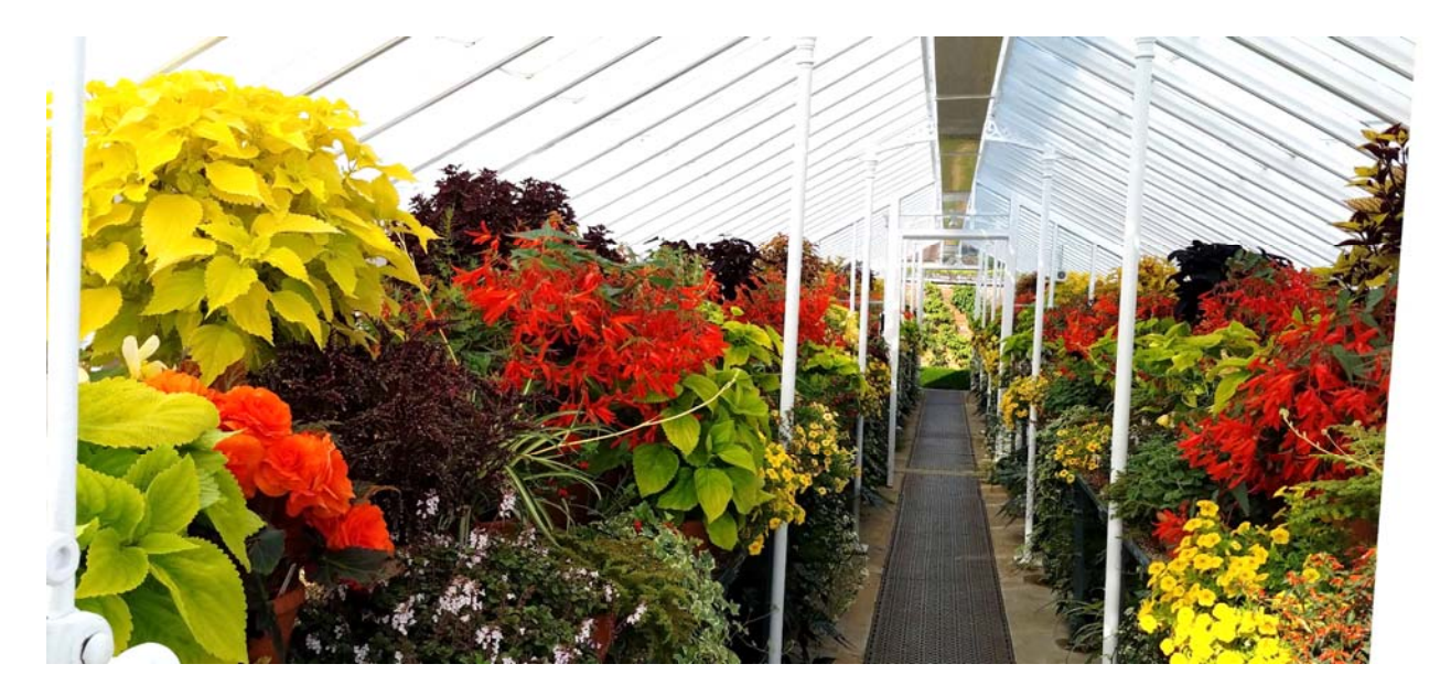
Figure 1. A cold frame containing annuals at West Dean Gardens in England

grateful for my experiences with the IPPS-SRNA Early-Career Exchange Program, and I will be sure to recommend it to my students and other young professionals.