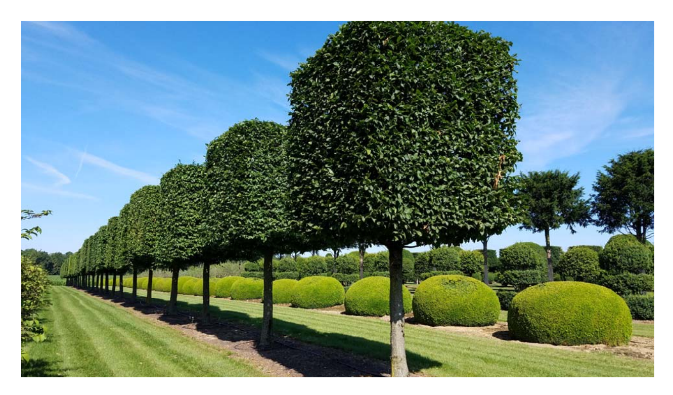
Figure 2. Rows of trees and shrubs on display at Solitair Nursery.