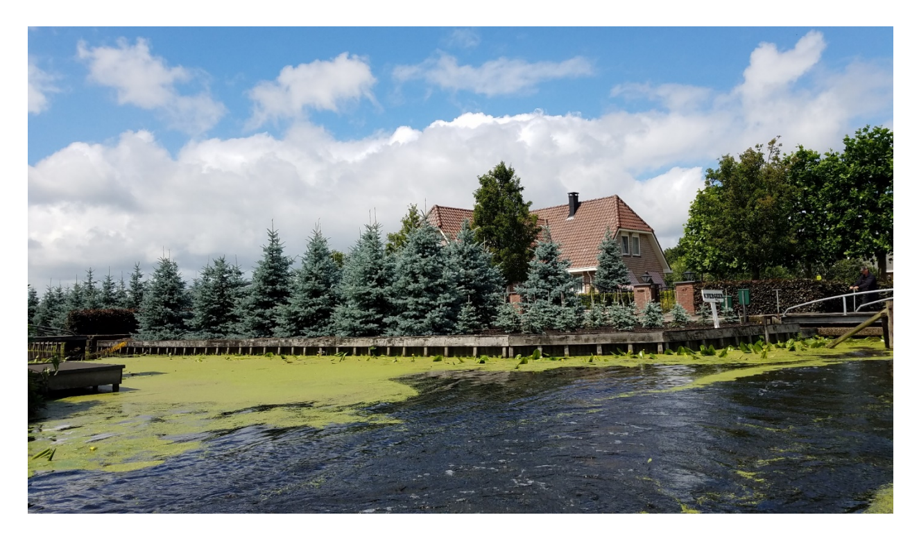
Figure 12. One of the many nurseries of the Boskoop District.