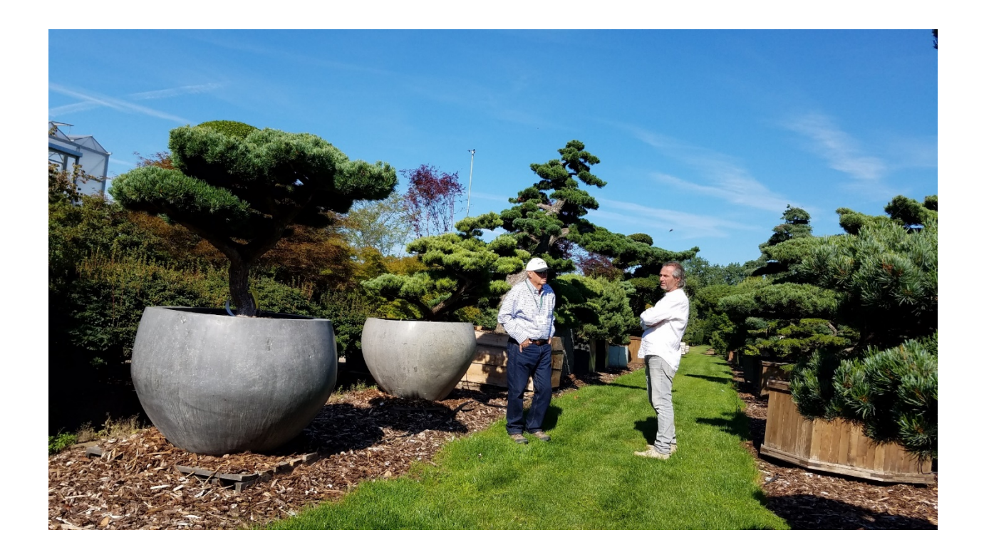
Figure 3. IPPS members admiring containerized trees at Solitair.