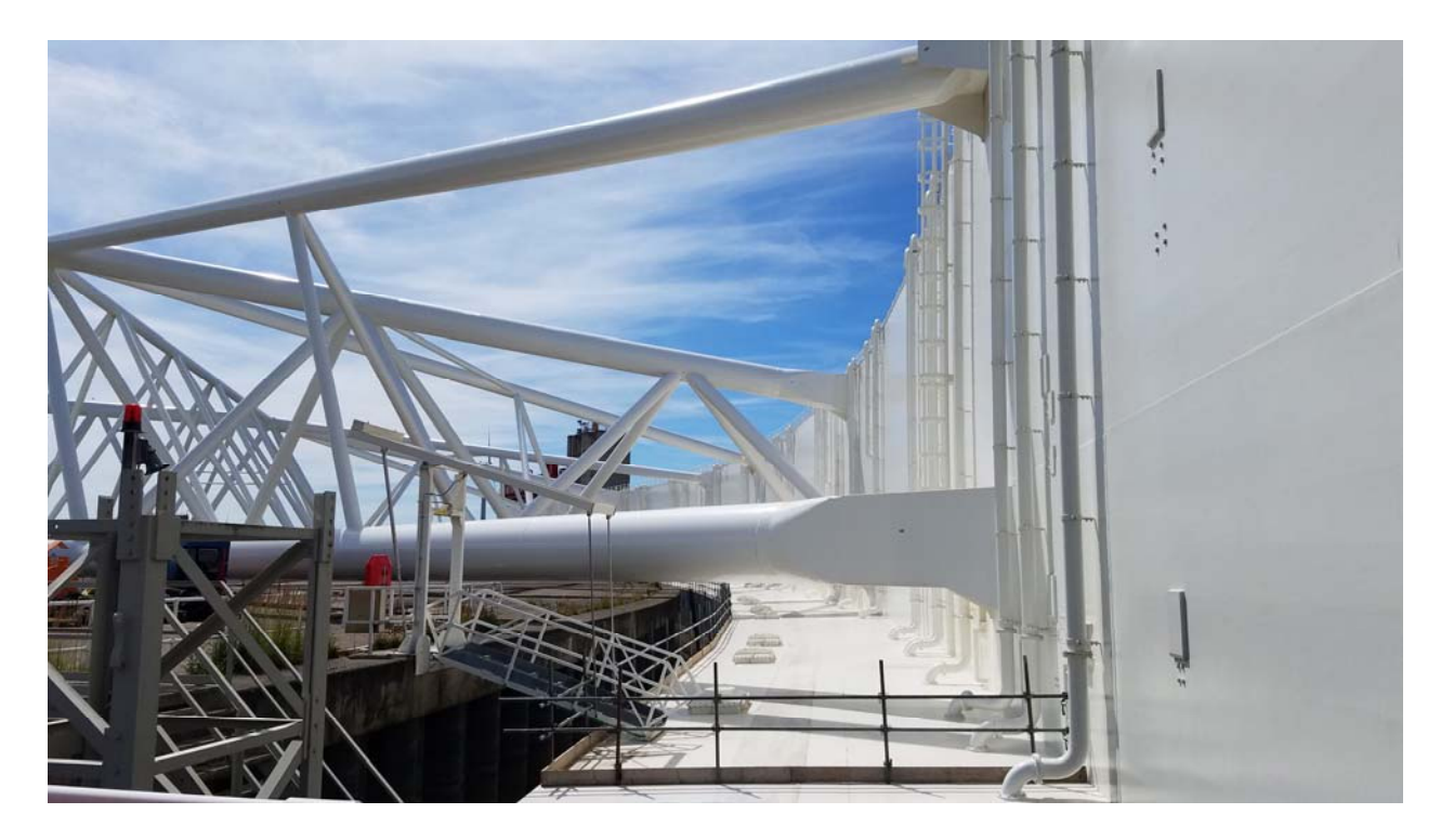
Figure 8. The Maeslantkering storm surge barrier.