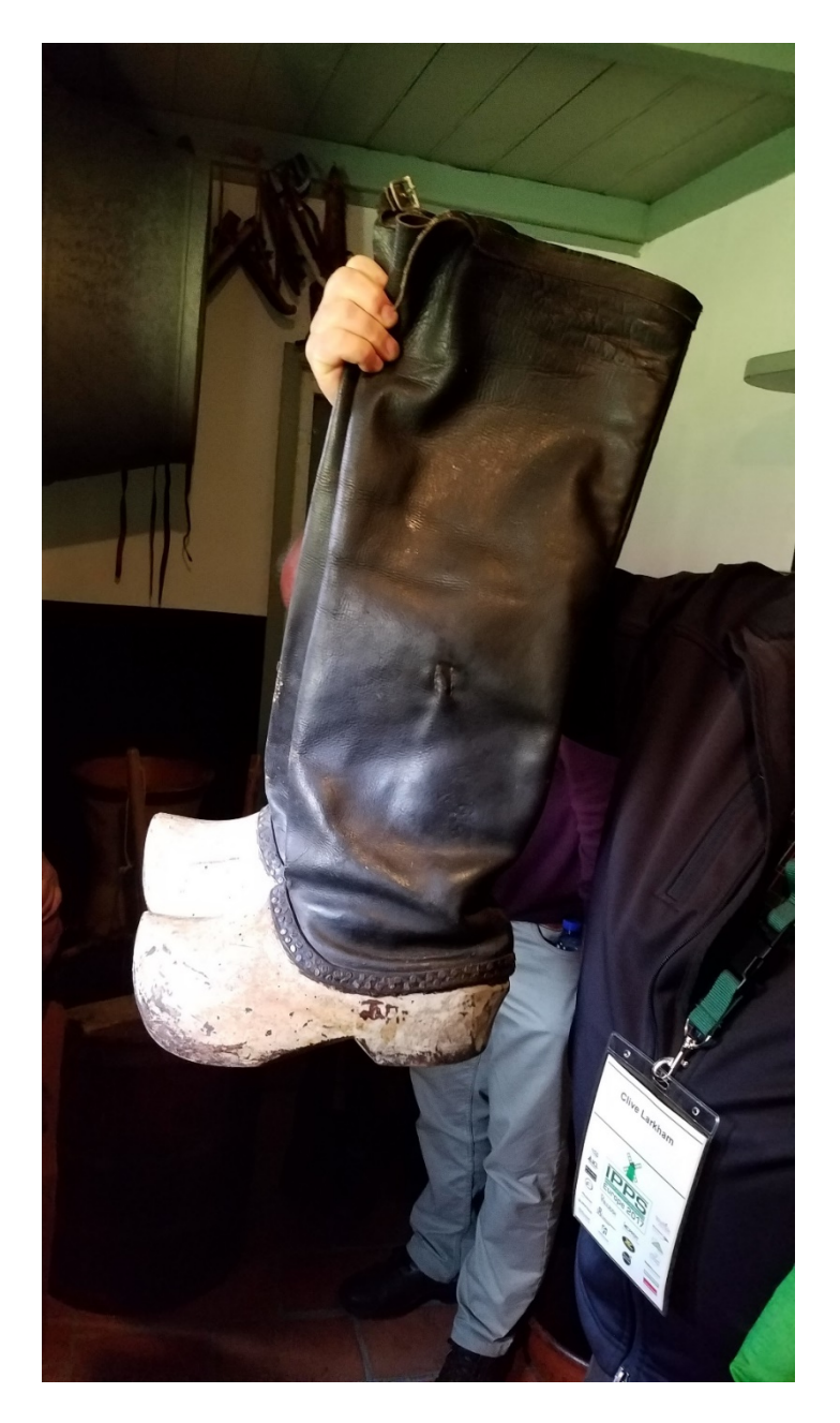
Figure 13. Traditional Dutch clog style work boots at the tree nursery museum in Boskoop.