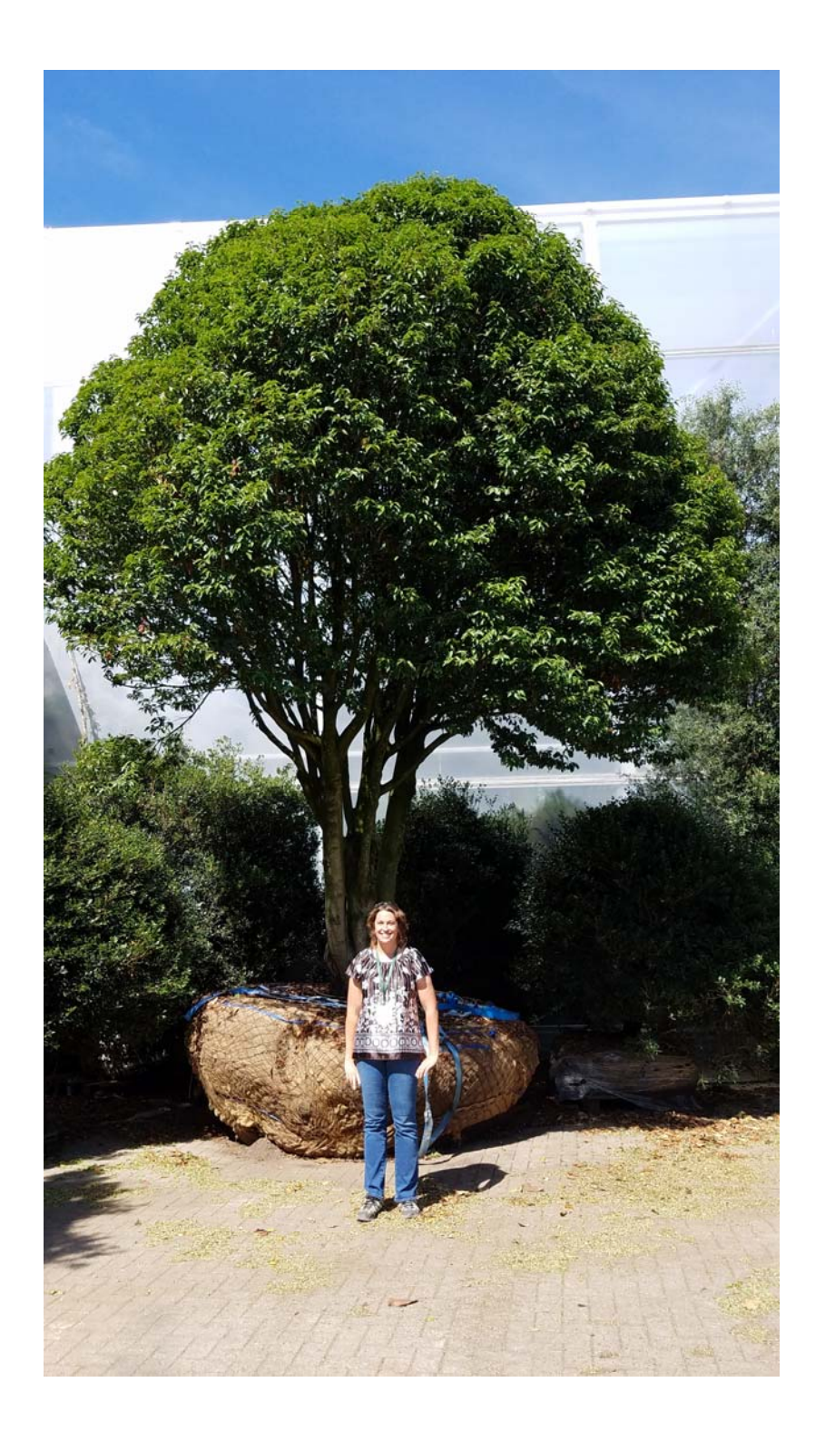
Figure 4. I stand in front of a ball and burlapped tree at Solitair for scale.