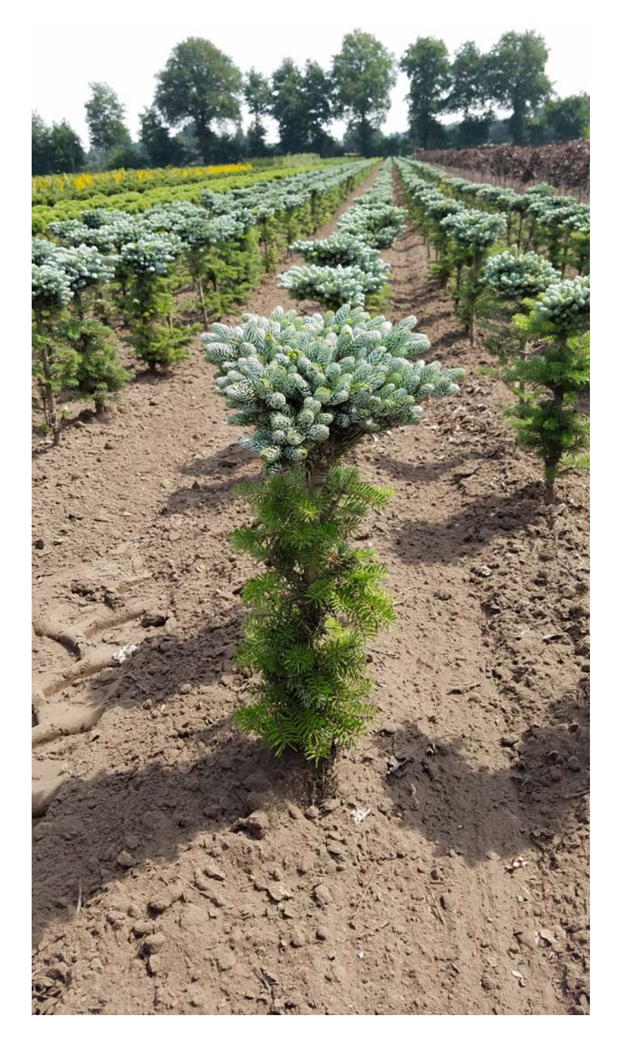
Figure 7. Grafted trees in the field with rootstock branches still growing.