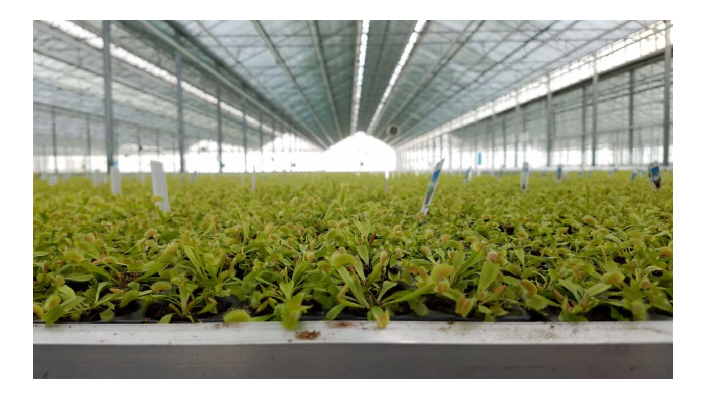
Figure 9. A greenhouse full of Venus flytraps at Corn.BAK.