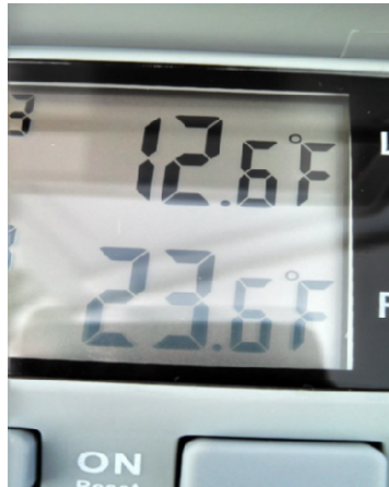
Figure 2. Comparison of outside and inside temperatures under a poly blanket.

To protect the plants from root kill and winter desiccation it is important to be a good weatherman and know what kind of weather is coming in advance. Covering the plants before a sharp cold snap keeps the root balls from freezing solid therefore protecting sensitive roots and allowing plants to replace moisture during the respiration process. Continue to use the poly blanket in the spring to cover and protect plants during the transition period in the spring.