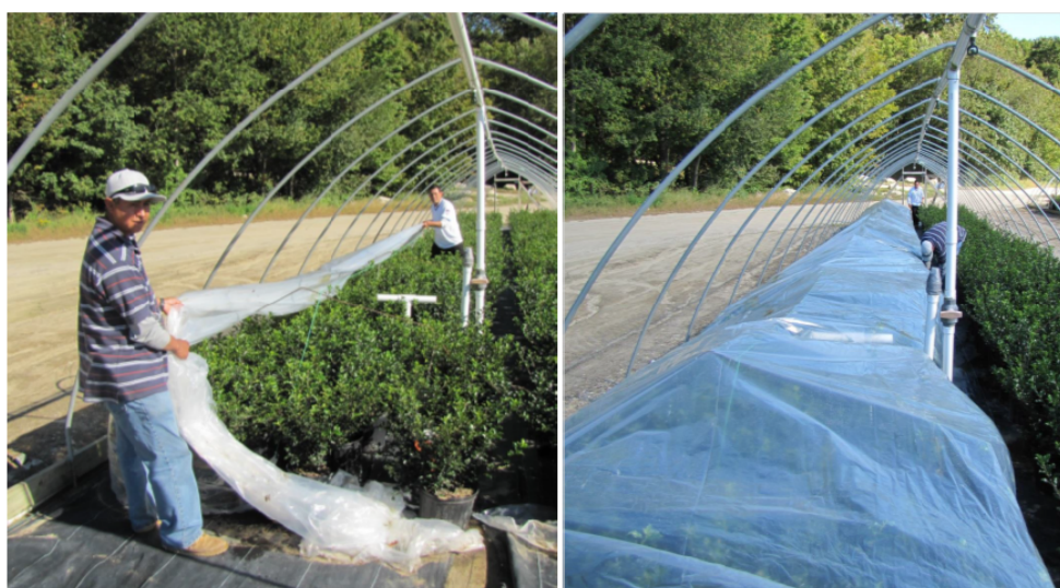
Figure 1. Creating a poly blanket within the over-wintering houses.

All three of these winter challenges (root kill, leaf desiccation, and spring transitional problems) can be overcome successfully by using a poly blanket within the over-wintering houses (Figure 1).