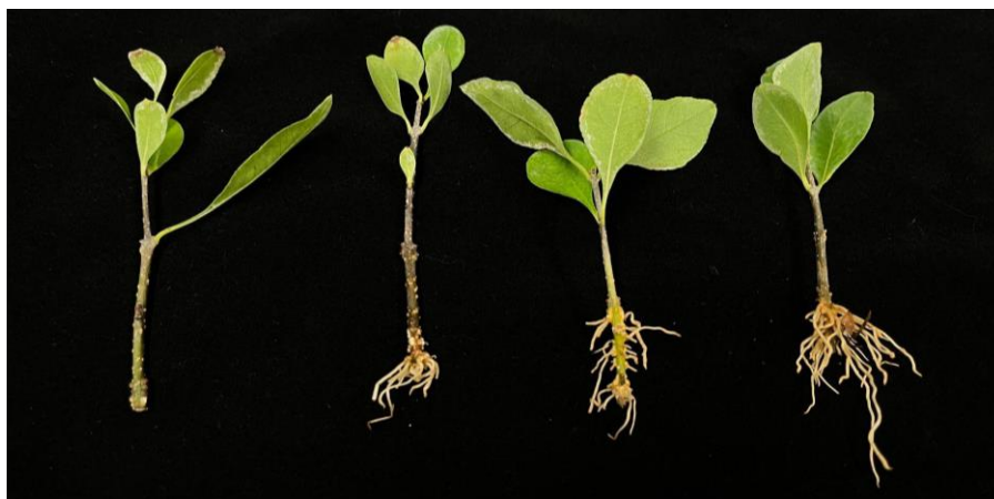
Figure 1: Above (left to right): Control (non-treated), 1000 ppm IBA, 2000 ppm IBA, and 3000 ppm IBA.

In this study, semi-hardwood stem cuttings rooted at 21%, 62%, 74%, and 87% for non-treated controls, 1000 ppm, 2000 ppm, and 3000 ppm IBA, respectively ( Fig. 1 ). Treatments of 1000 ppm, 2000 ppm, and 3000 ppm IBA were all significantly different when compared to the non-treated control for number of roots ( Fig 2 ). However, the three IBA treatments were not significantly different from each other. This trend can also be seen for root length ( Fig. 3 ).