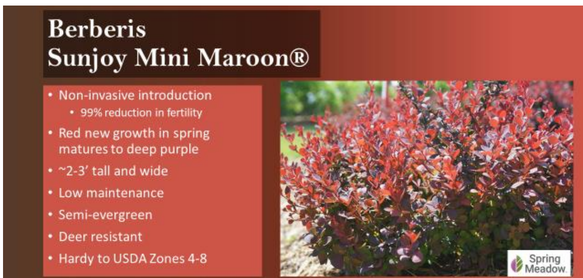
Figure 5. Berberis Sunjoy Mini Maroon®.

compared to traditional B. thunbergii introductions ( Fig. 5 ). Non-invasive Miscanthus introductions Bandwidth (compact introduction) and High Frequency exhibit attractive golden banding ( Fig. 6 ).