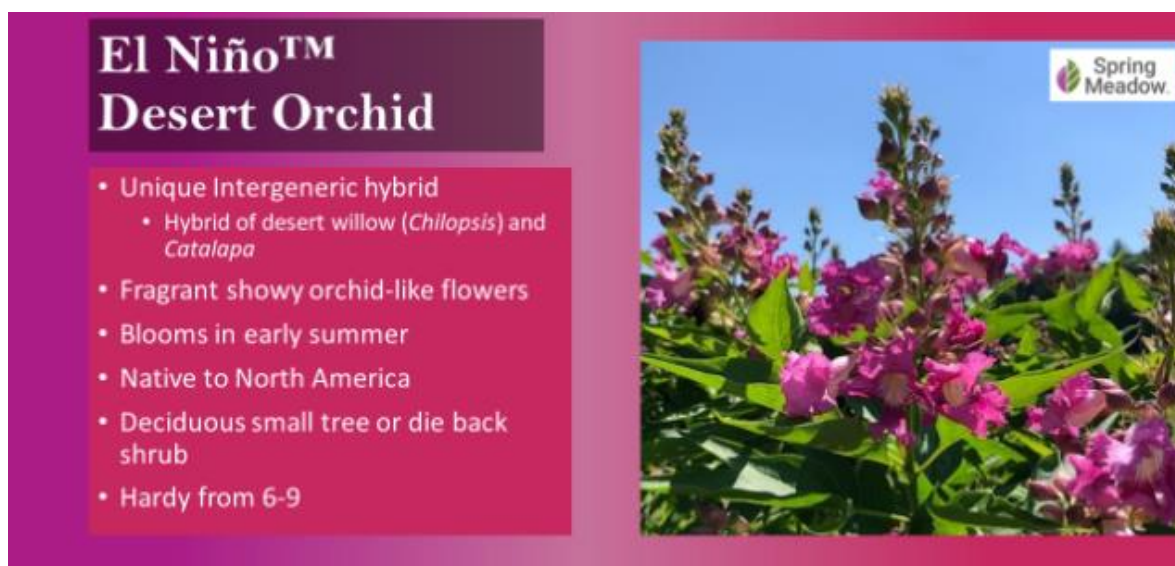
Figure 12. Intergeneric hybrid xChitalpa El Niño™.

shrub to multi-stemmed tree with long racemes of showy purple flowers (Fig. 12).