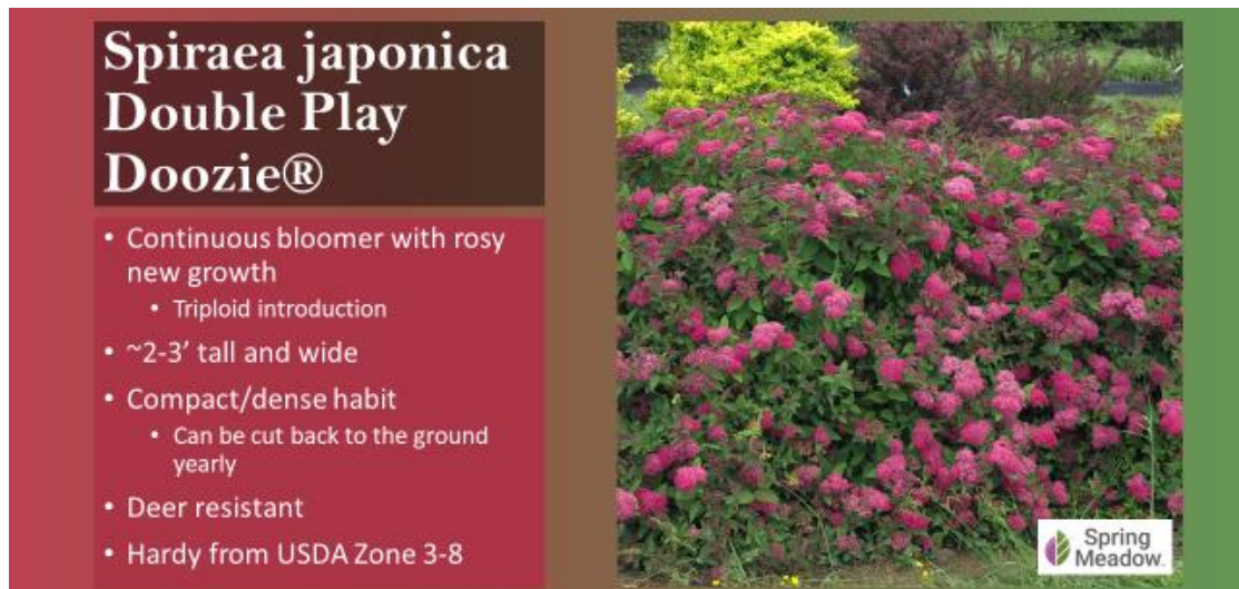
Figure 4. Spiraea japonica Double Play Doozie®.

Invasive Berberis thunbergii and Miscanthus sinensis have been banned in multiple states. Replicated, multi-year field trials of Sunjoy Todo™ and Mini Maroon® have shown these non-invasive barberries exhibit a 99% reduction in female fertility