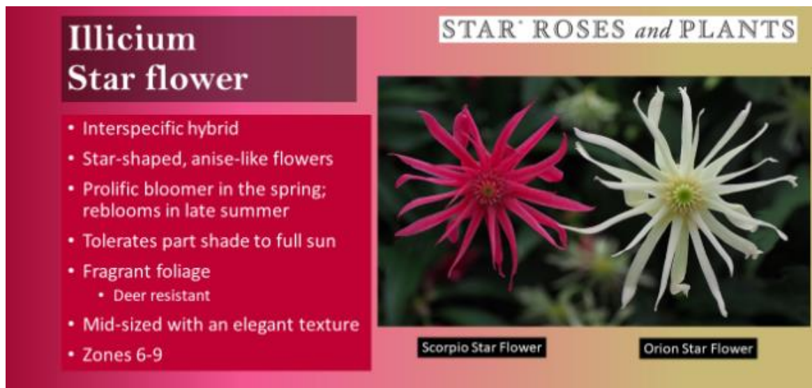
Figure 11. Illicium Scorpio and Orion.

and Orion are adaptable, reblooming, broadleaf evergreens with a dense habit (Fig. 11).