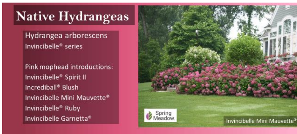
Figure 1. List of native Hydrangea arborescens pink mophead introductions from the MCIL: Invincibelle Mini Mauvette® pictured.

Native Hydrangeas. Hydrangea arborescens is a popular, adaptable native hydrangea that blooms on new wood. The MCIL has five pink mophead introductions and two dwarf white mophead introductions ( Figs. 1 and 2 ).