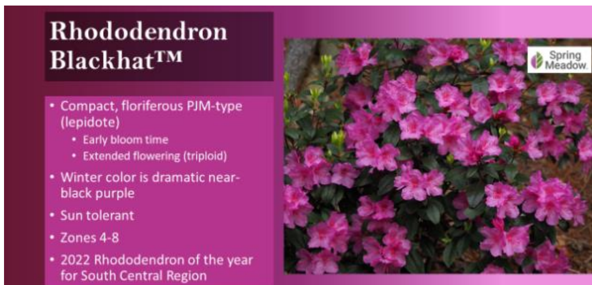
Figure 8. PJM rhododendron Blackhat™

Perfecto Mundo® Evergreen azaleas. The MCIL has been working on azaleas for over 15 years with a focus on cold-hardiness, longevity in bloom, floral coverage and strong field and container performance.