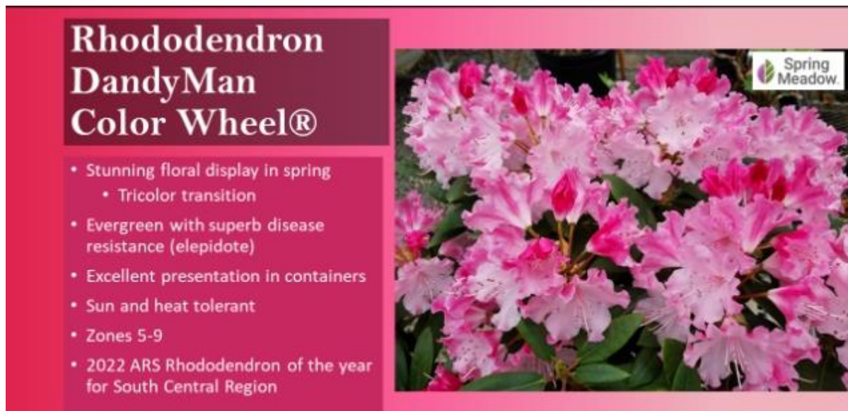
Figure 7. Rhododendron Dandyman Color Wheel®.

selected for durability in the landscape and excellent container presentation ( Figs. 7 and 8 ).