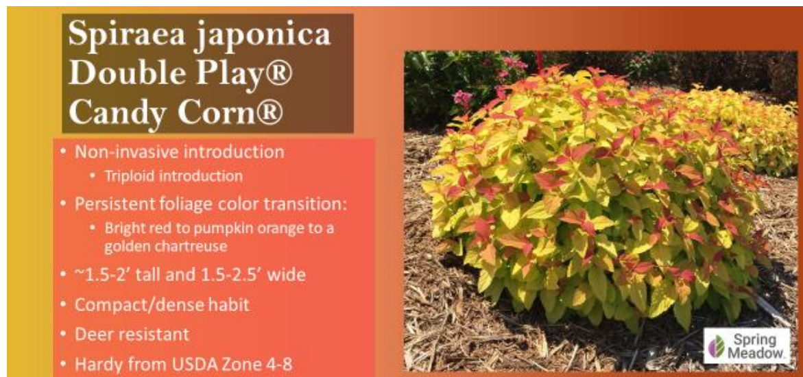
Figure 3. Spiraea japonica Double Play® Candy Corn®.

tions with other exciting ornamental benefits, including bright foliage and continuous blooming (Figs. 3 and 4).