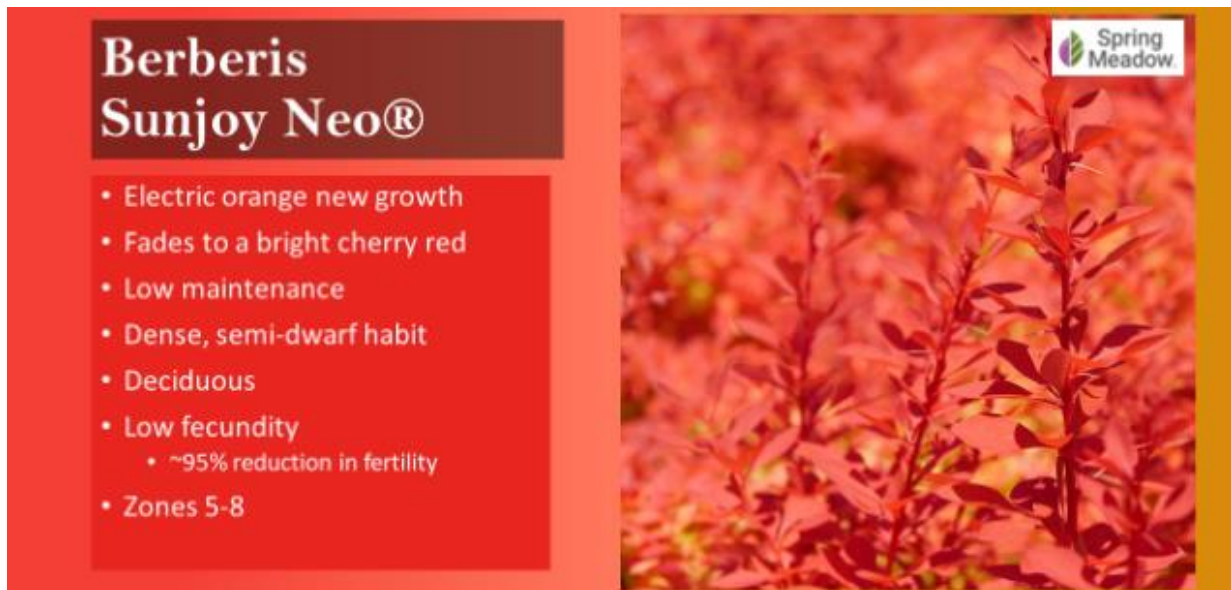
Figure 10. Berberis Sunjoy Neo®.

growth Sunjoy® Neo® and Orange Pillar (Fig. 10).