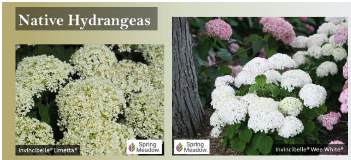
Figure 2. Compact white Hydrangea arborescens introductions from the MCIL.

Newer non-invasive introductions. Spiraea japonica , while not yet on invasive plant ban lists, is considered to be an emerging invasive. Double Play® Candy Corn® and Doozie® are non-invasive introduc-