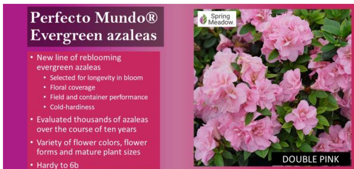
Figure 9. Perfecto Mundo Double Pink evergreen azalea.

See Table 1 for the complete list of Perfecto Mundo® azaleas ( Fig. 9 ).