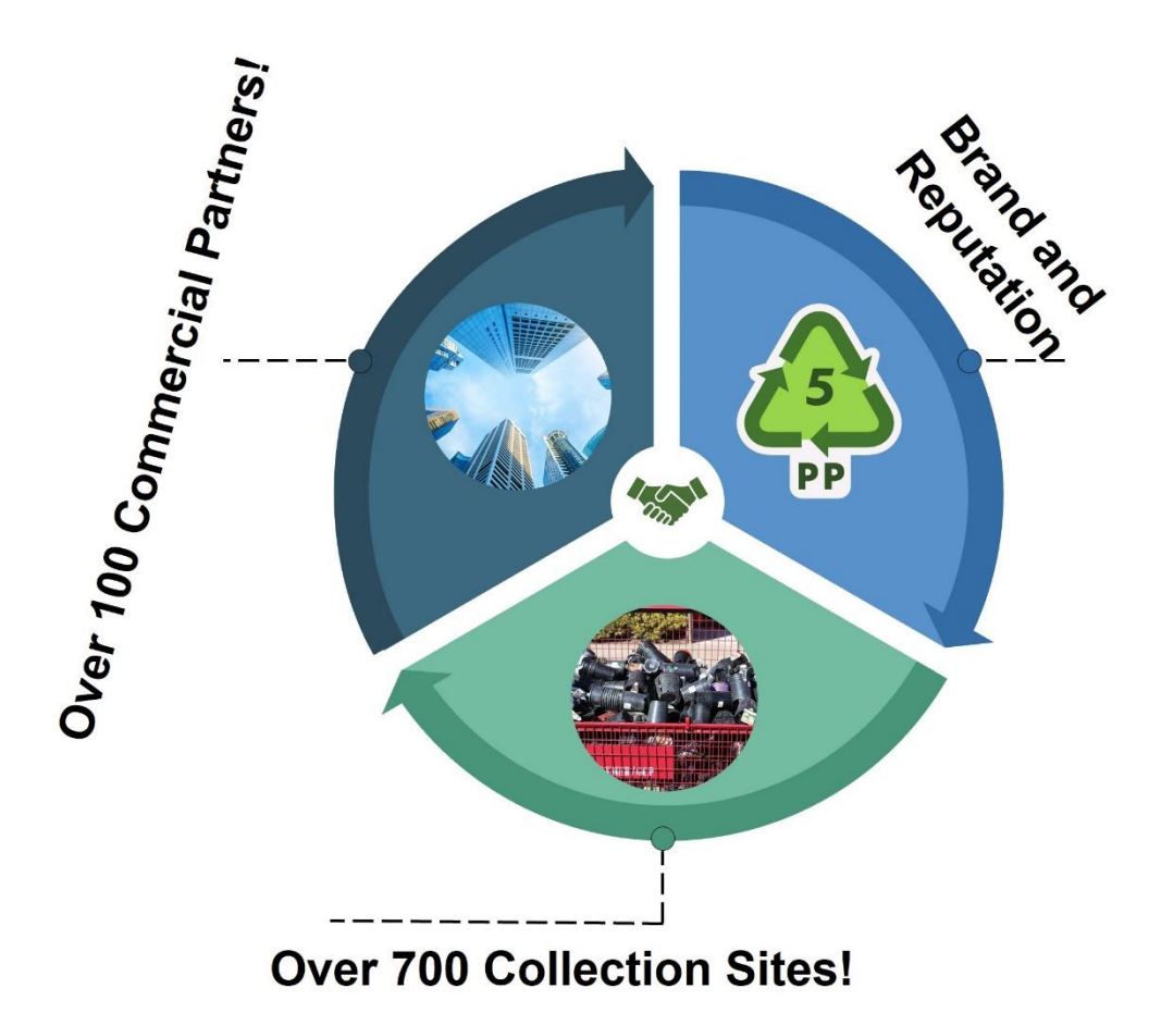
Figure 3. Three pillars of success of horticultural plastic recycling in Australia: increasing number of commercial partners and their collection sites with the development of an incredible reputation of our brand.

aging scrap plastics. We have created an engaging financial incentive to responsibly consume and reproduce our PP5!