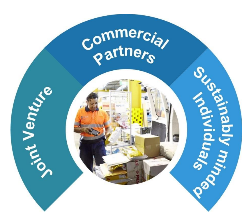
Figure 2. Sustainable circular model of PP5 Initiative.

Working as a closed loop system within Horticulture, manufactured recycled, carbon black PP5 from Polymer Processors is passed onto Norwood Industries and GCP to produce plant pots, containers, and labels for production nurseries throughout Australia. Nurseries then collect and return end of use PP5 or on sell growing plants, passing the products to landscape projects or retailers for sale to home gardeners. Landscapers, retailers, and home gardeners are then all included in this recycling initiative by being either able to provide a PP5 collection point or return material to the nearest one.