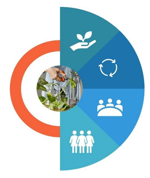
Figure 1. A symbolic presentation of the required initiatives to manage the proper disposal of plant propagation plastics used commonly throughout Australia. The commonly used plastics (hand symbol) require proper disposal methods (circle). PP5 initiative by three major horticultural suppliers has support from many leading nurseries and the community.

The combination of complicated steps to work through, has been achieved through dedication from Horticulture Sector businesses right across the country co-operating together to achieve a meaningful outcome for consumption and our responsibility to manage landfill. Figure 1 symbolically presents the initiatives and support base to manage the proper disposal of plant propagation plastics used commonly throughout Australia.