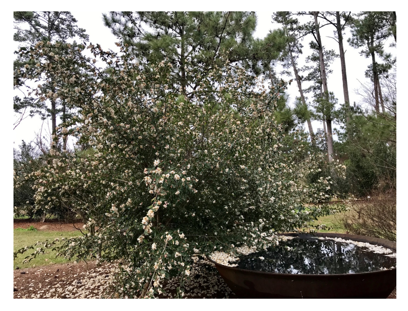
Figure 5. Camellia 'Snow Blizzard'.