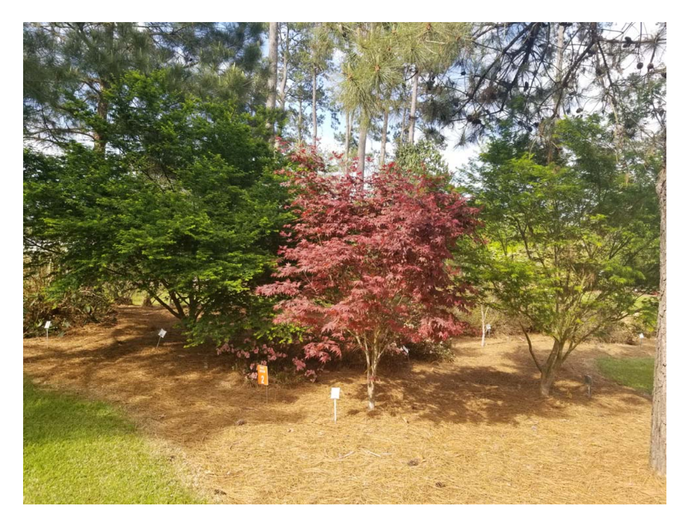
Figure 3. The LSU AgCenter Hammond Research Station, Piney Woods Garden.