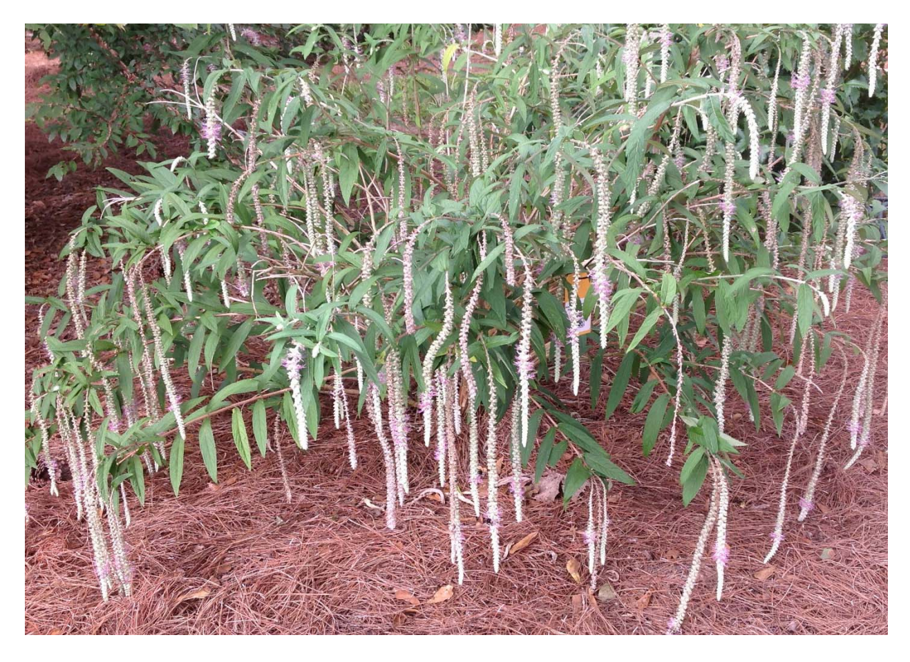
Figure 20. Rostrinucula dependens.