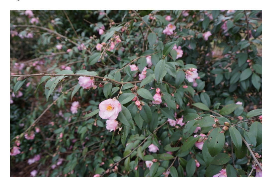
Figure 6. Camellia 'Tiny Princess'.