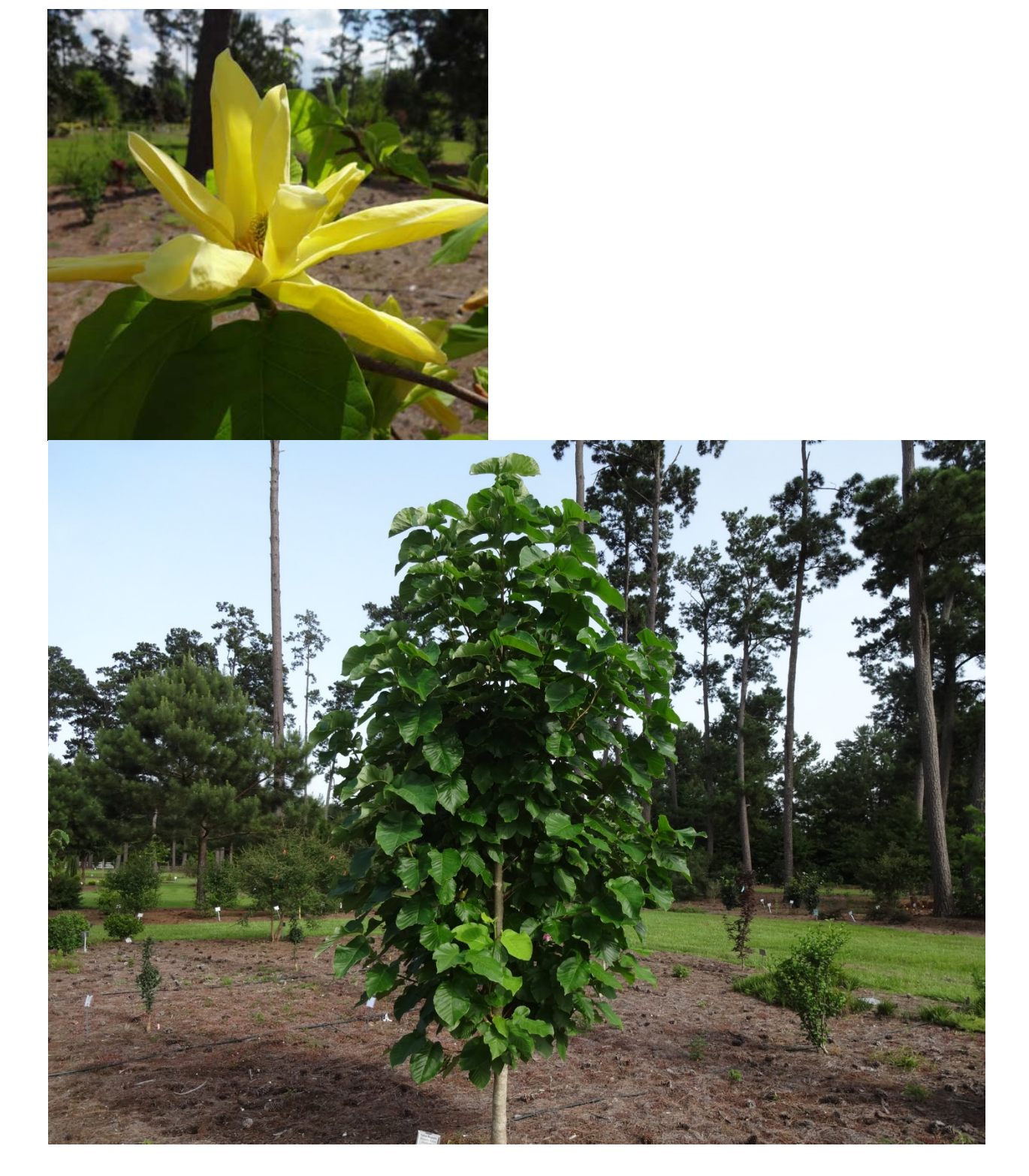
Figure 13. Magnolia 'Anilou'.