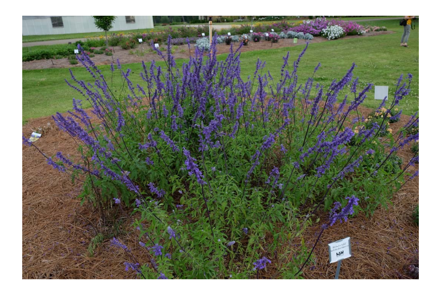
Figure 21. Salvia farinacea 'Rebel Child'.