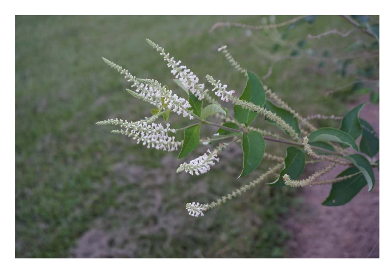
Figure 4. Aloysia virgate.