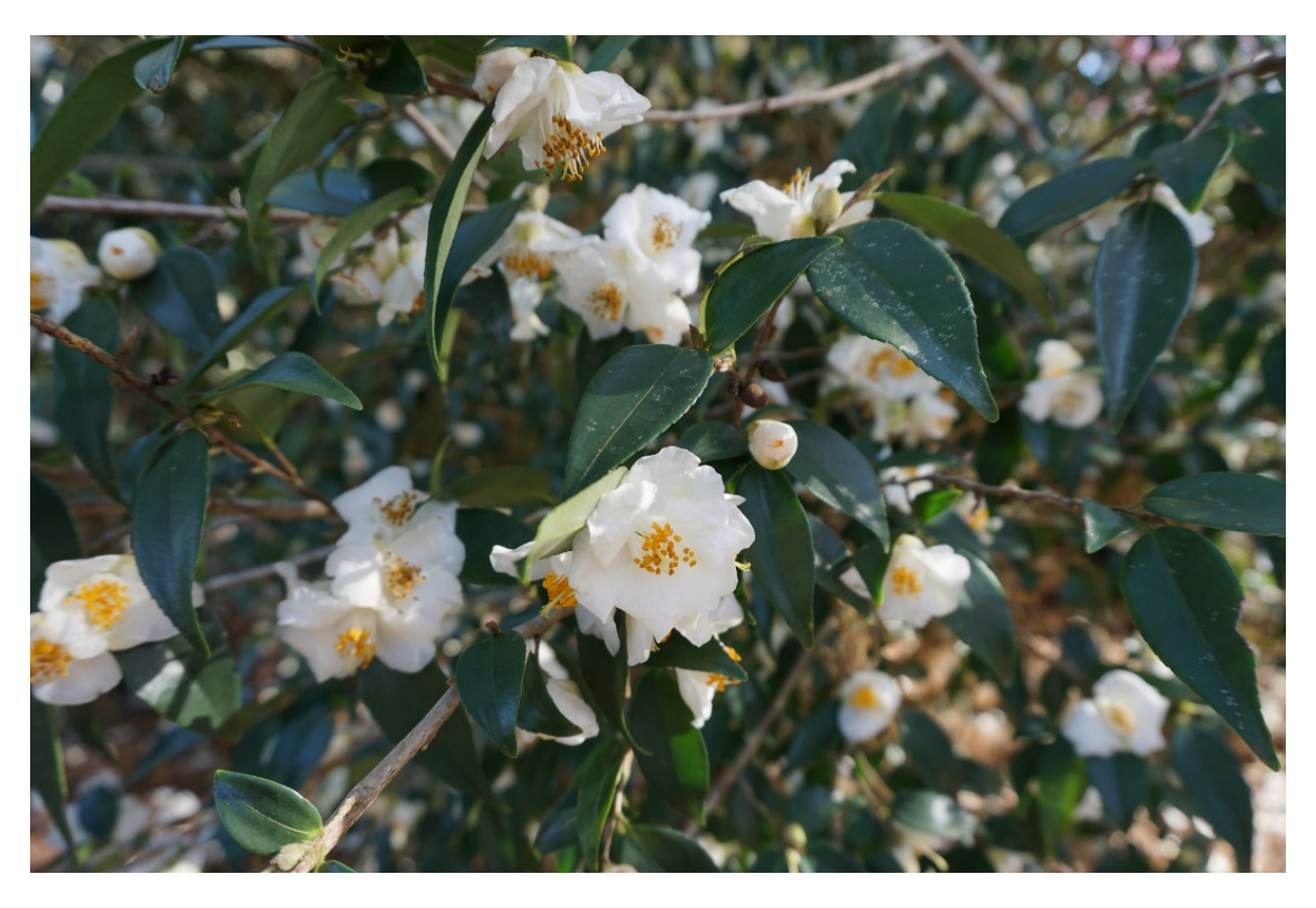
Figure 8. Camellia fraternal.