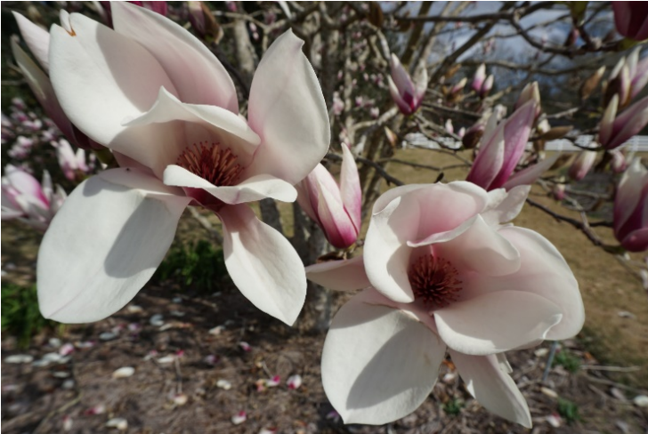
Figure 15. Magnolia 'Jon Jon'.