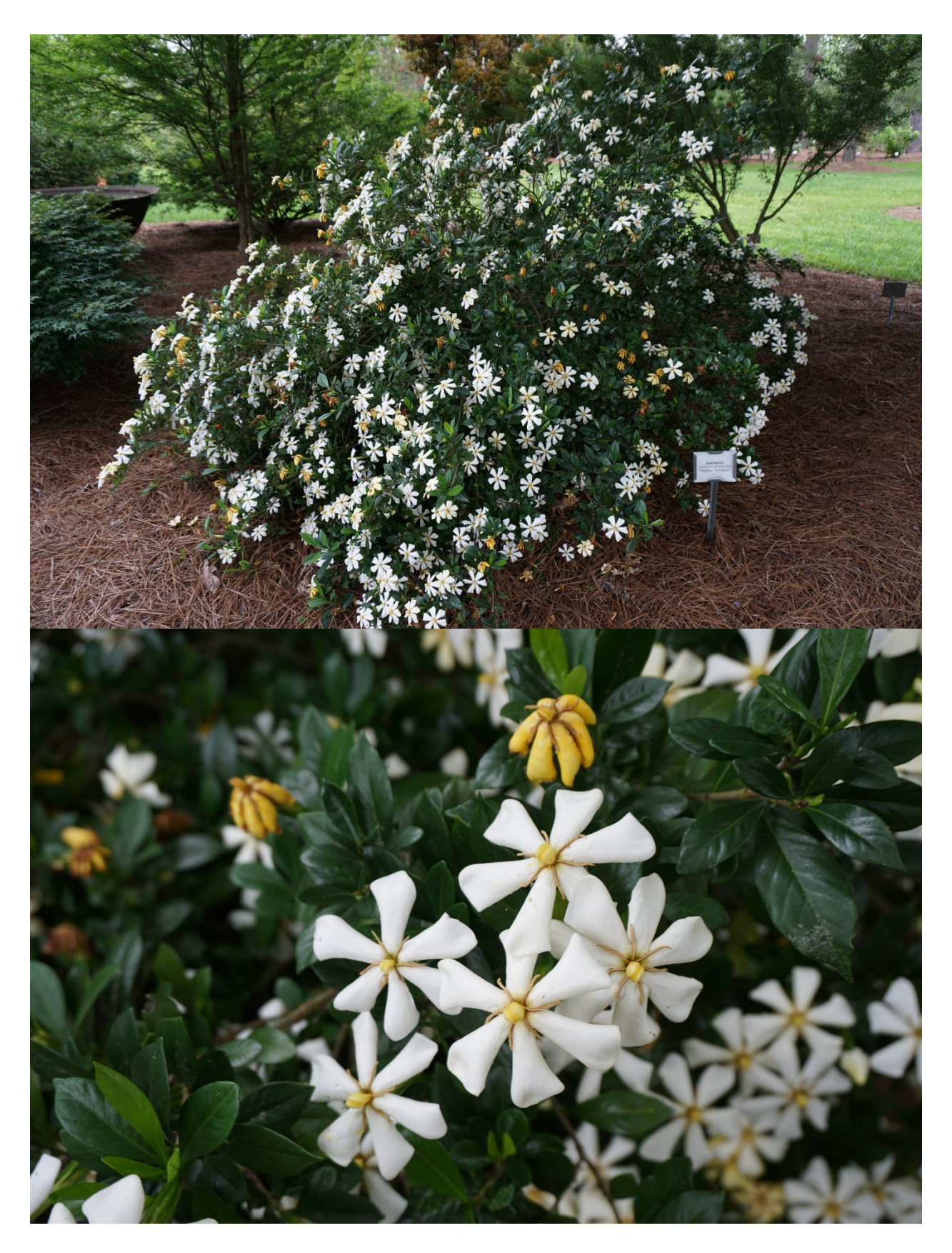
Figure 10. Gardenia jasminoides 'Martha Turnbull'.