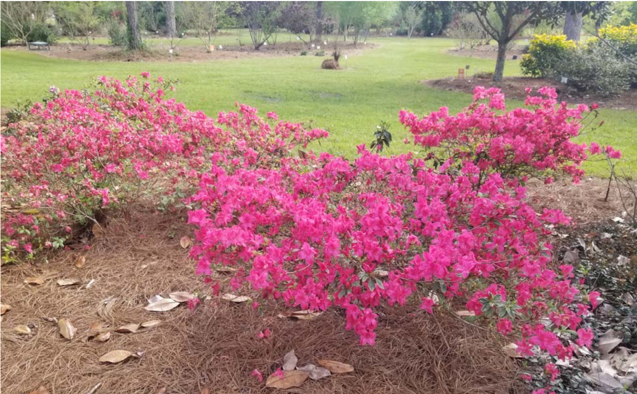
Figure 18. Rhododendron 'Red Luster'.