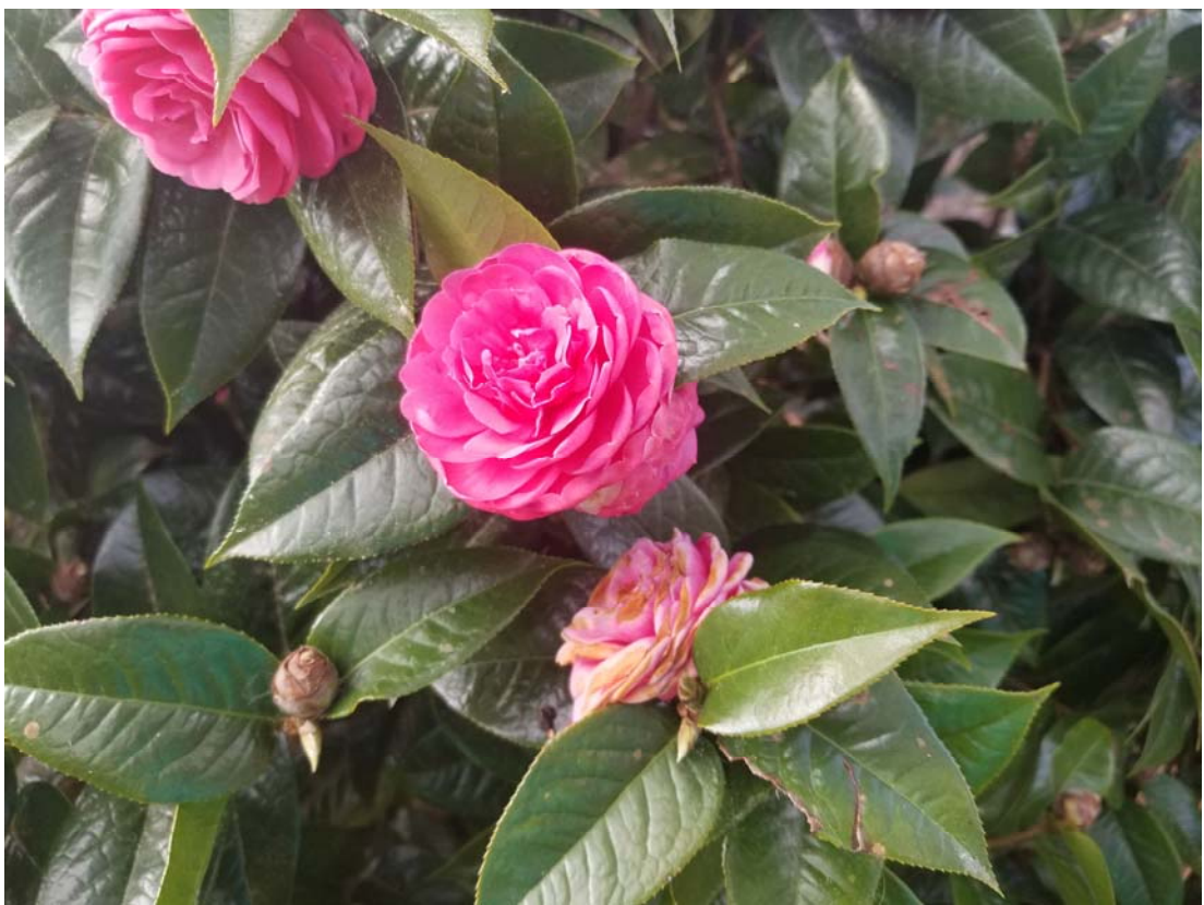
Figure 7. Camellia edithae.