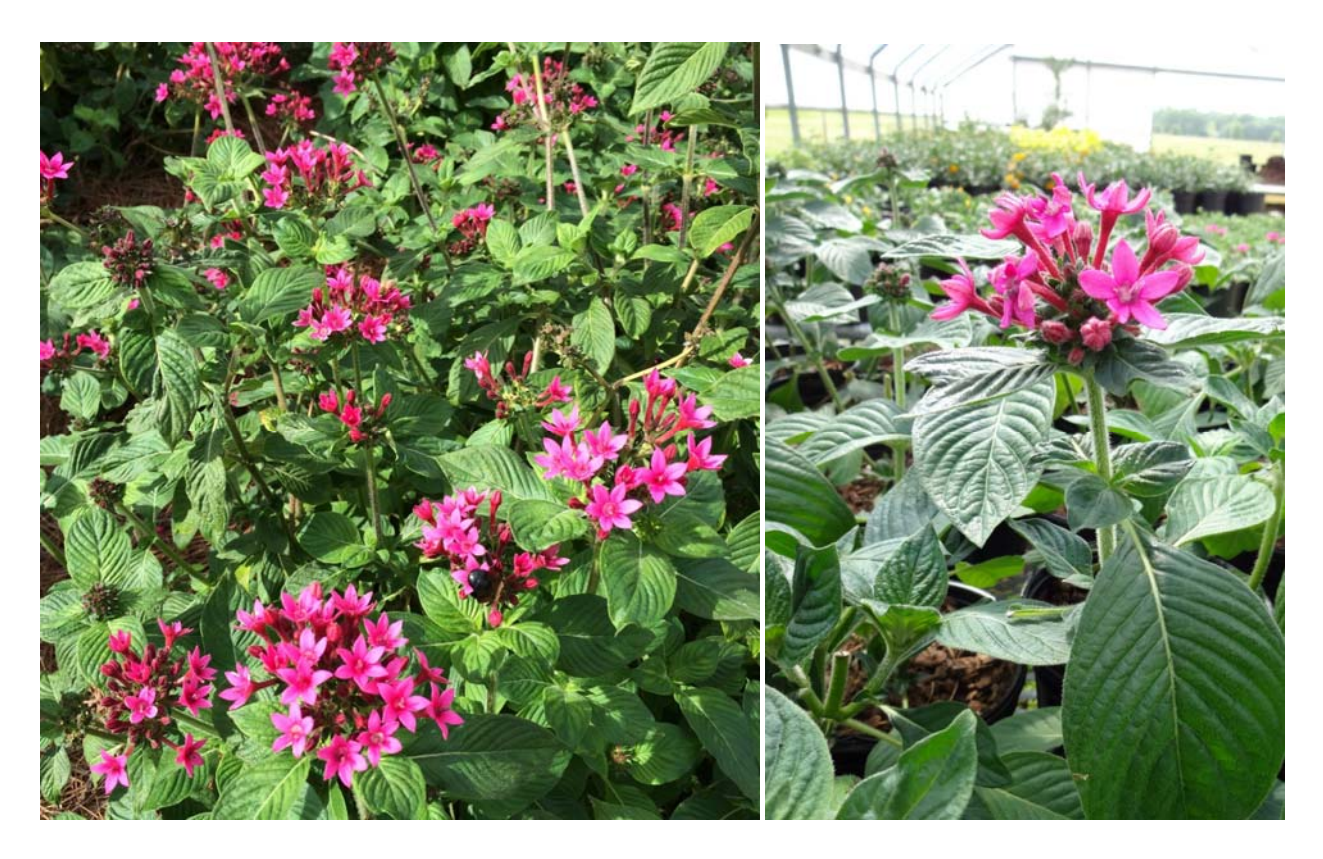
Figure 16. Pentas lanceolata 'Nova'.