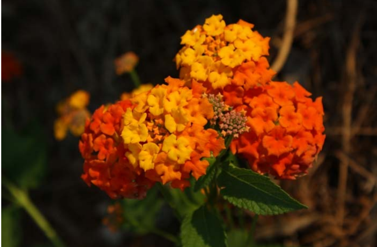
Figure 12. Lantana X 'Grandpa's Pumpkin Patch'.