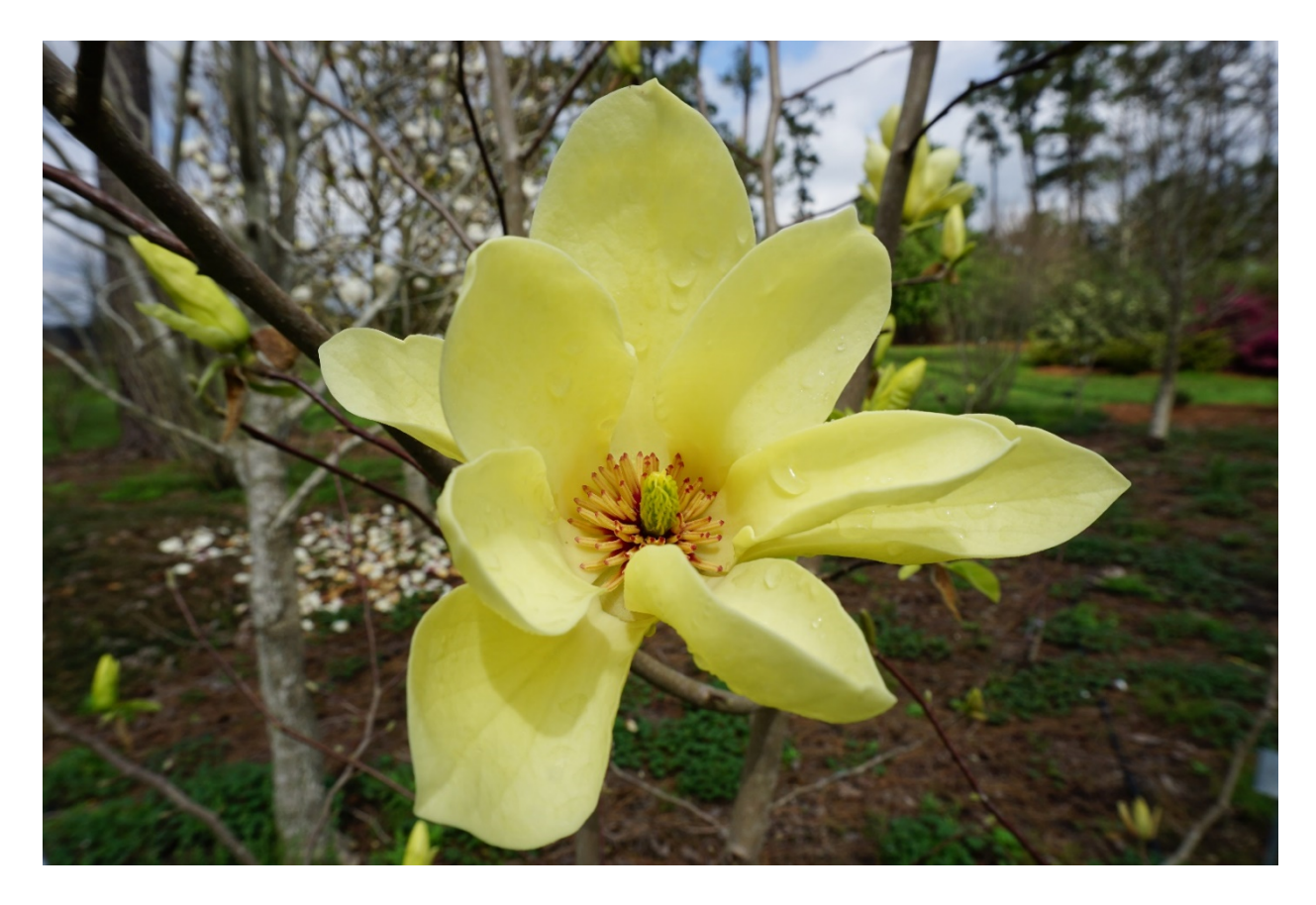
Figure 14. Magnolia 'Butterflies'.