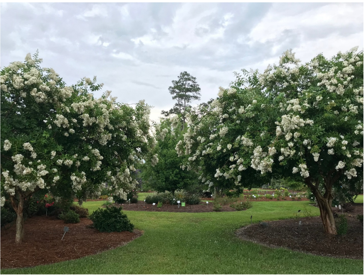
Figure 1. The LSU AgCenter Hammond Research Station, Allen D. Owings Sun Garden bedding plant trials.