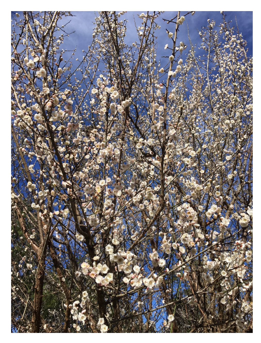
Figure 17A. Prunus mume 'Fragrant Snow'.