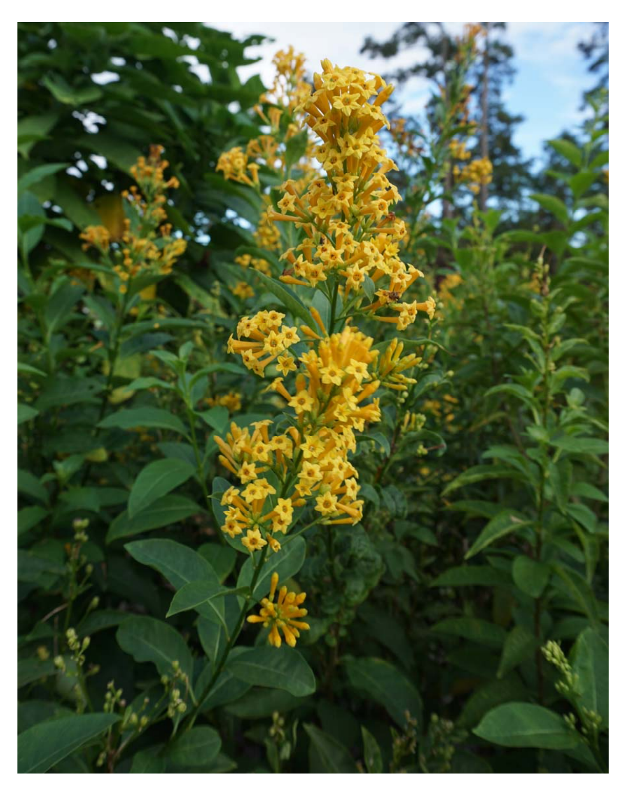
Figure 9. Cestrum x 'Orange Peel'.