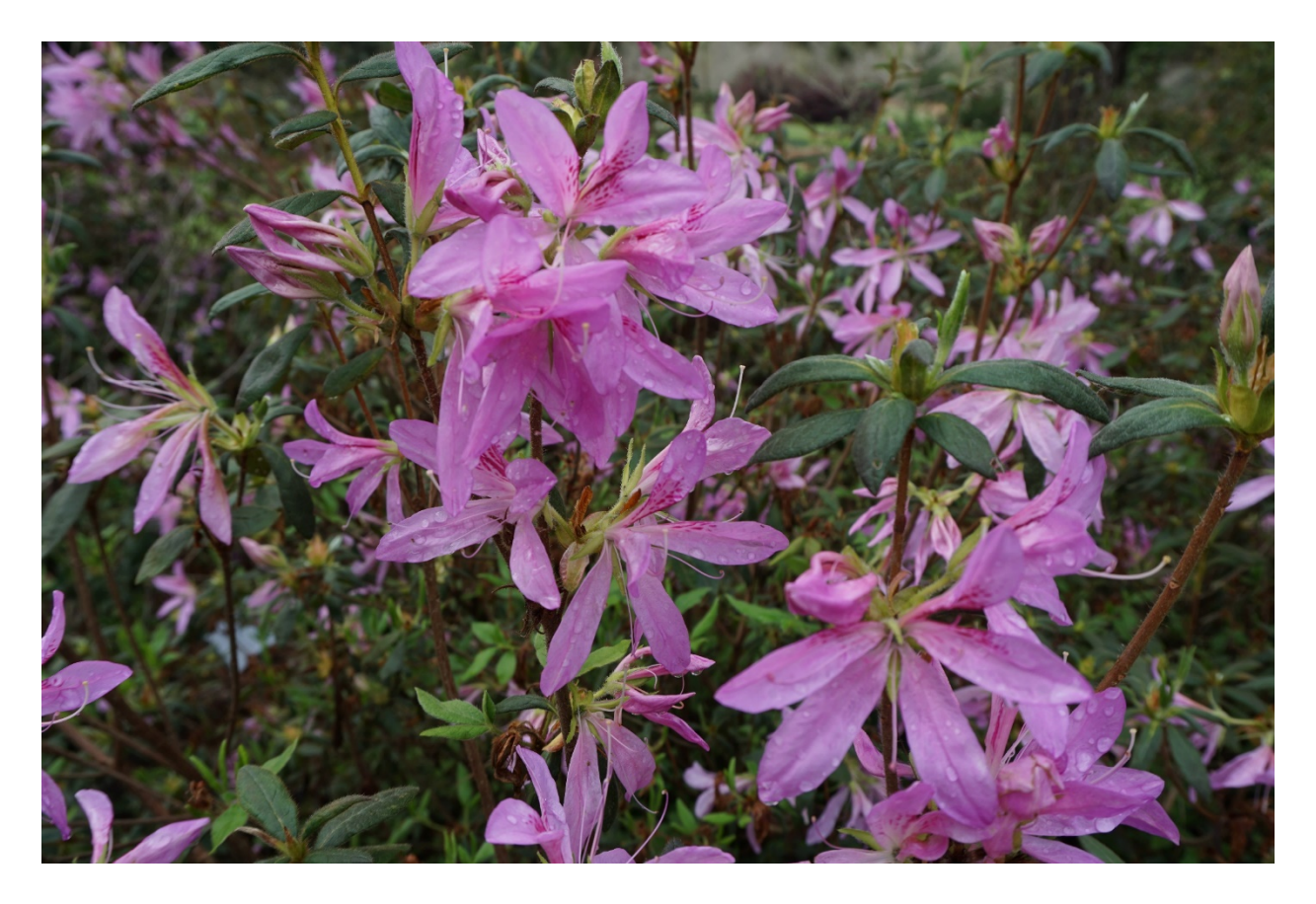
Figure 19. Rhododendron x 'Koromo Shikibu'.