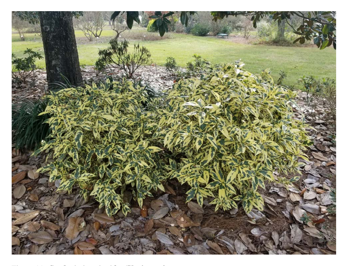
Figure 11. Gardenia jasminoides 'Variegata'.