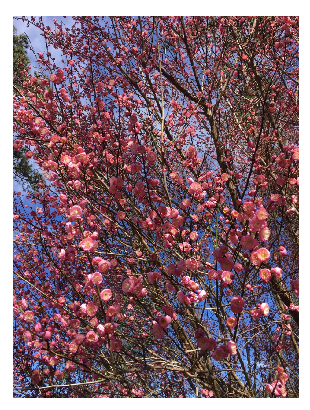
Figure 17B. Prunus mume 'Peggy Clarke'.