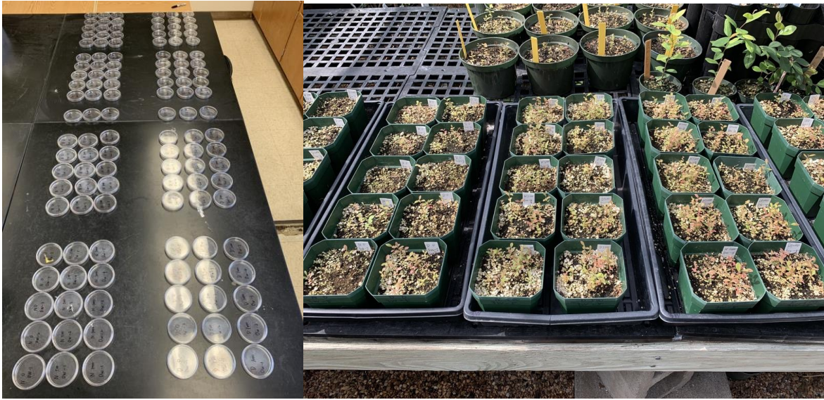
Figure 1. Sparkleberry ( Vaccinium arboreum ) seed collected in November and December in 2018, subjected to different gibberellic acid (GA 3 ) (0, 500, and 1,000 mg L -1 ) in petri dishes (A); Sparkleberry ( Vaccinium arboreum ) seed collected in November and December in 2018, germinated after 3 weeks of cold stratification with GA 3 treated at 0, 500, and 1,000 mg L -1 (B).

6 and 9 weeks. After cold stratification, pots were then taken out and placed in the greenhouse. Pots were watered with DI water as needed throughout the experiment.