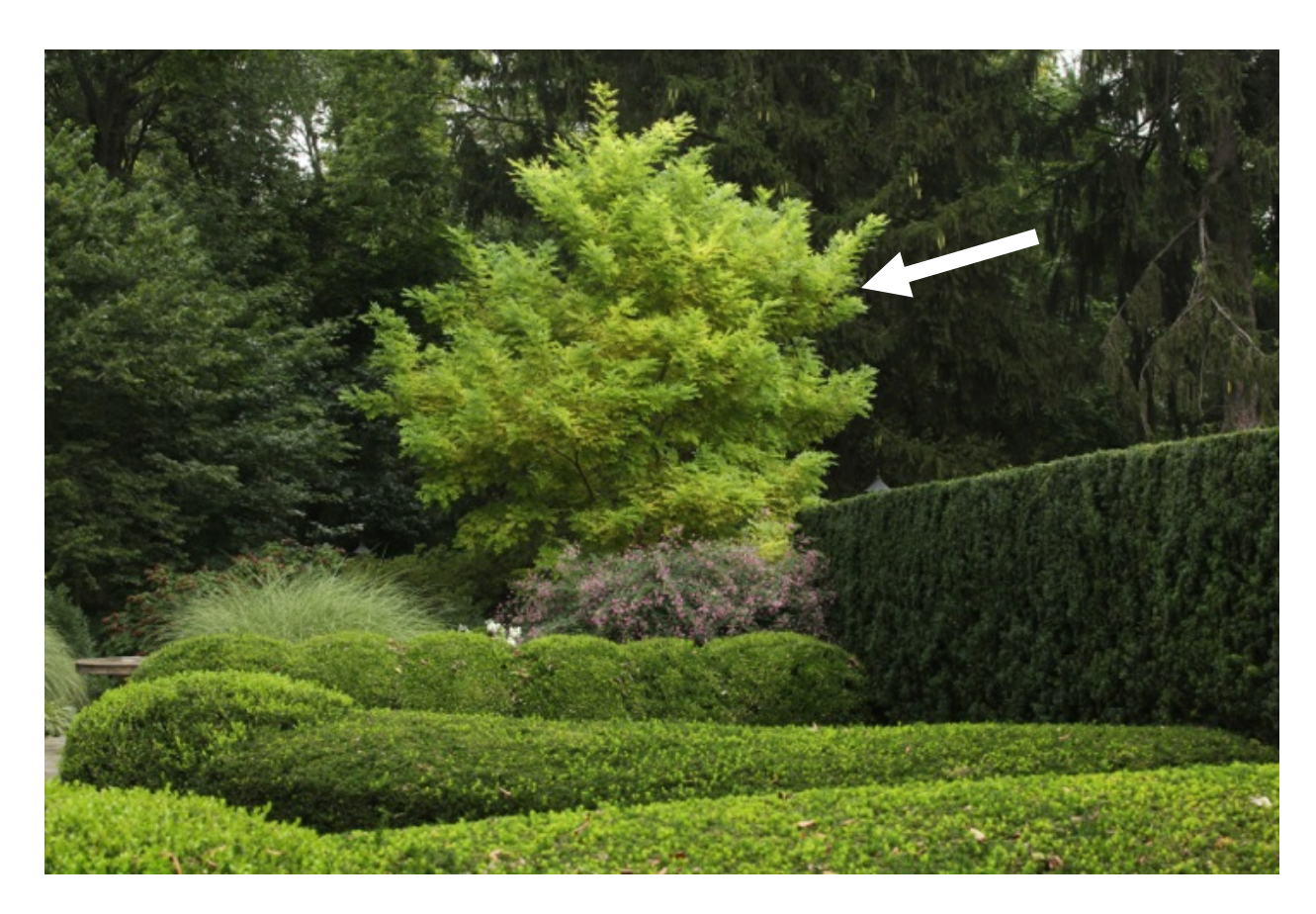
Figure 3. Sophora japonica 'Winter Gold' (arrow).