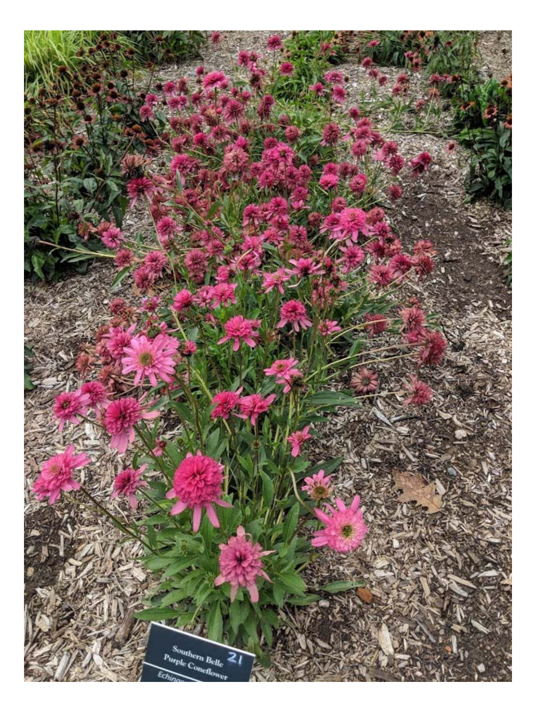
Figure 6. Echinacea 'Southern Belle'.