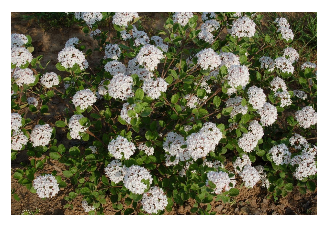
Figure 5. Viburnum carlesii 'Sugar N' Spice ^{TM} '