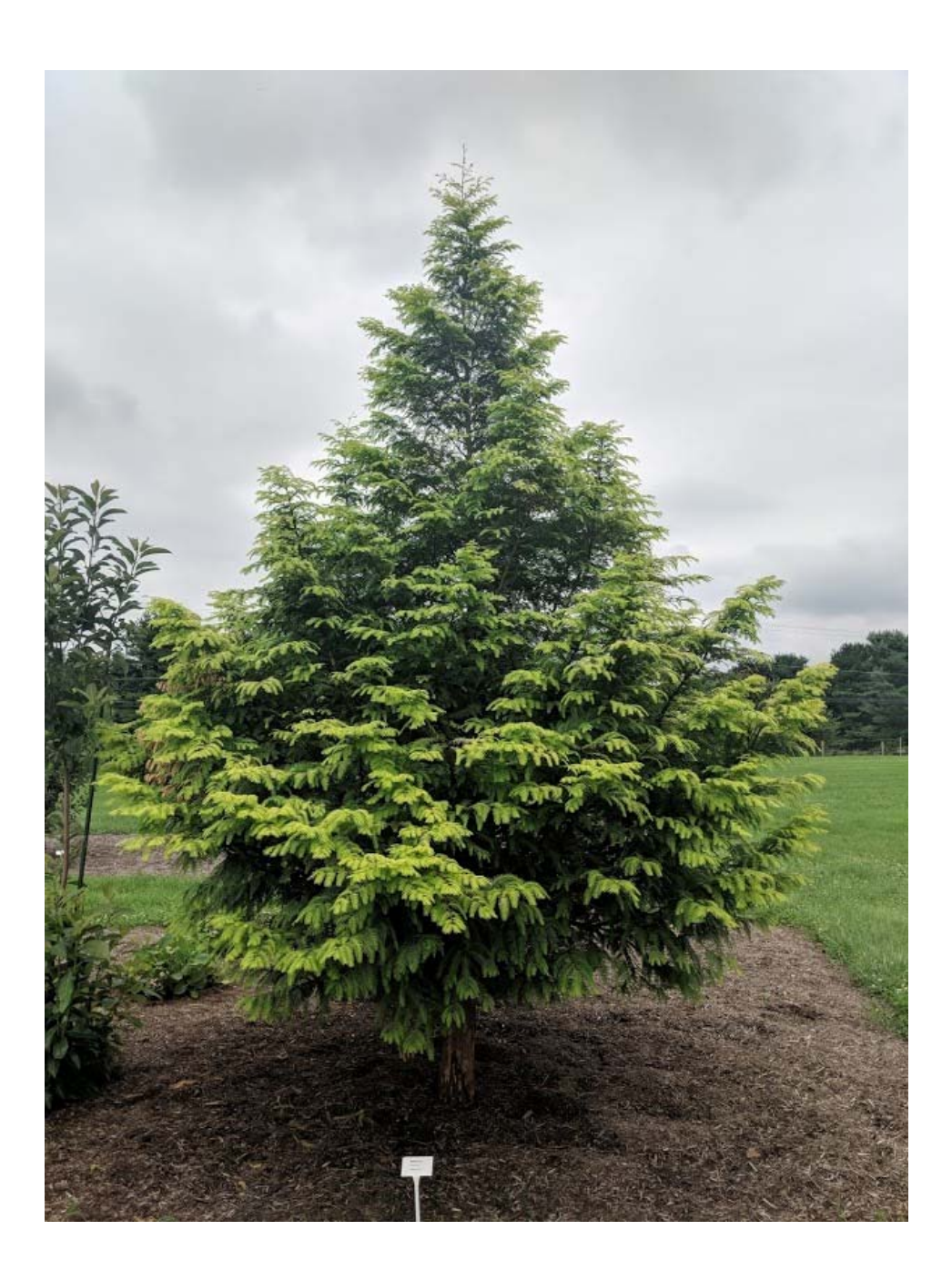
Figure 4. Metasequoia 'Amber Glow'.