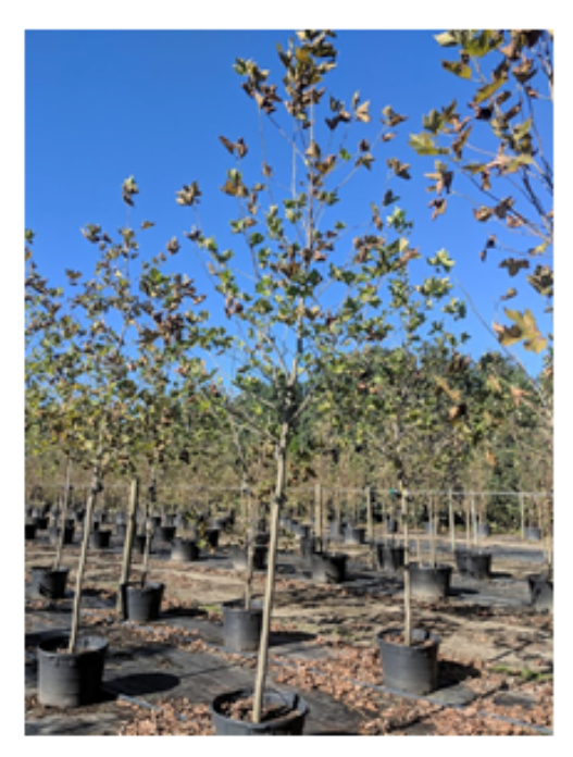
Figure 1. Platanus x acerifolia Exclamation! ^{\text{TM}}