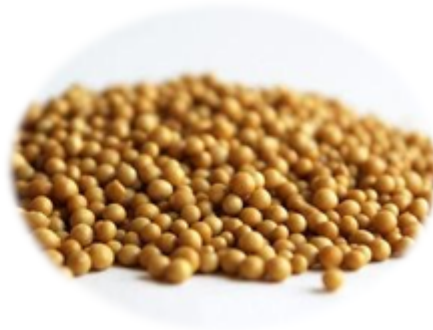
Figure 7. Osmocote® is an example of a resin coated, controlled release fertilizers (CRF).