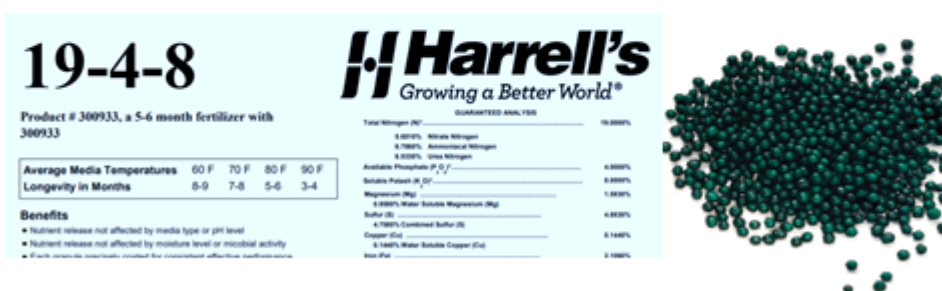
Figure 12. Polymer coated Polyon® controlled release fertilizer (CRF).