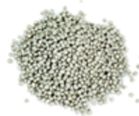
Figure 10. Polymer coated, Nutricote® CRF.