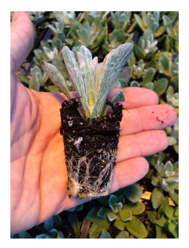
Figure 1. Chrysopsis gossypina ssp. cruiseana stem cutting one week after sticking in Fafard3B using a 72 cell flat and overhead mist.