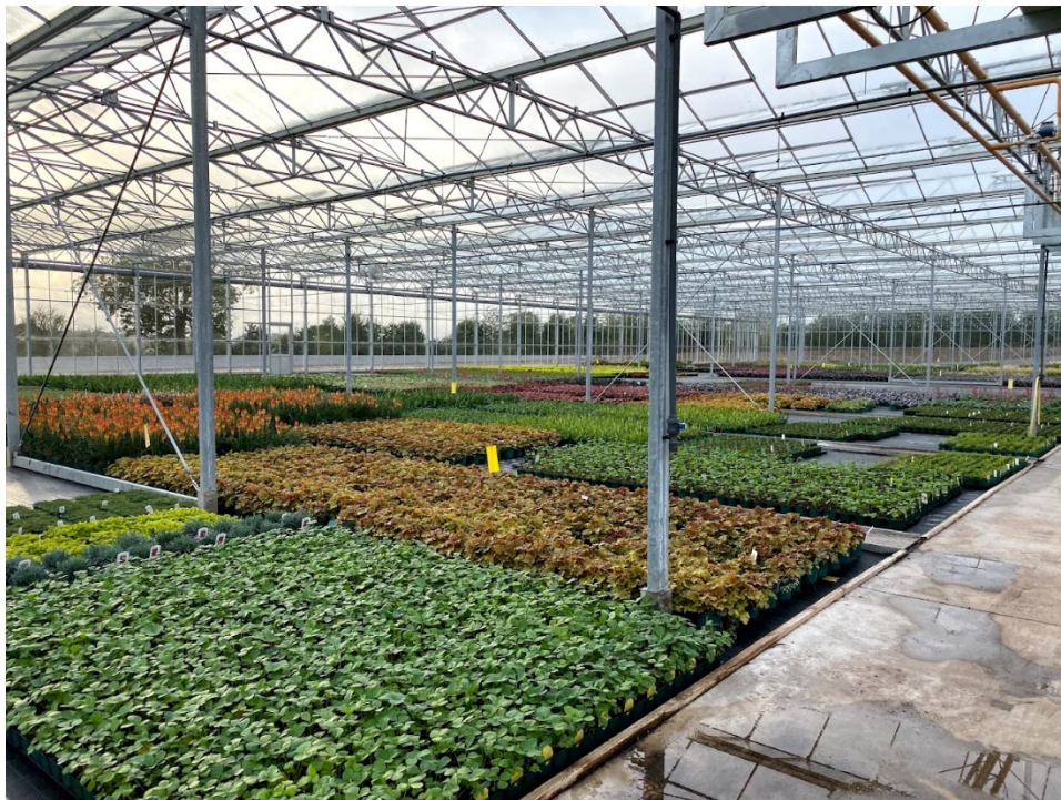
Figure 10. The brand-new glasshouse at Hawkesmill Nurseries.