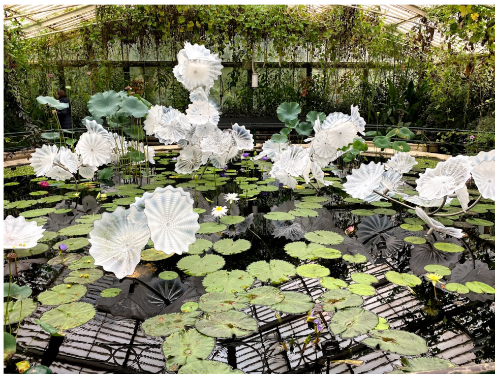
Figure 13. The desert zone in the Princess of Wales Conservatory at Kew (top); Chihuly sculpture in the Waterlily House at Kew (bottom).