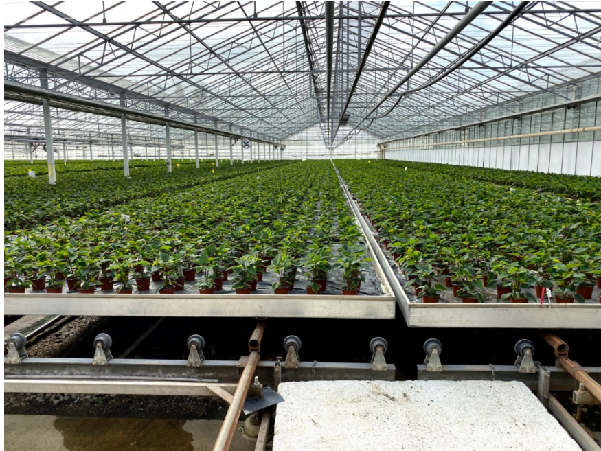
Figure 9. Poinsettias at Bordon Hill, part of Ball Colegrave.