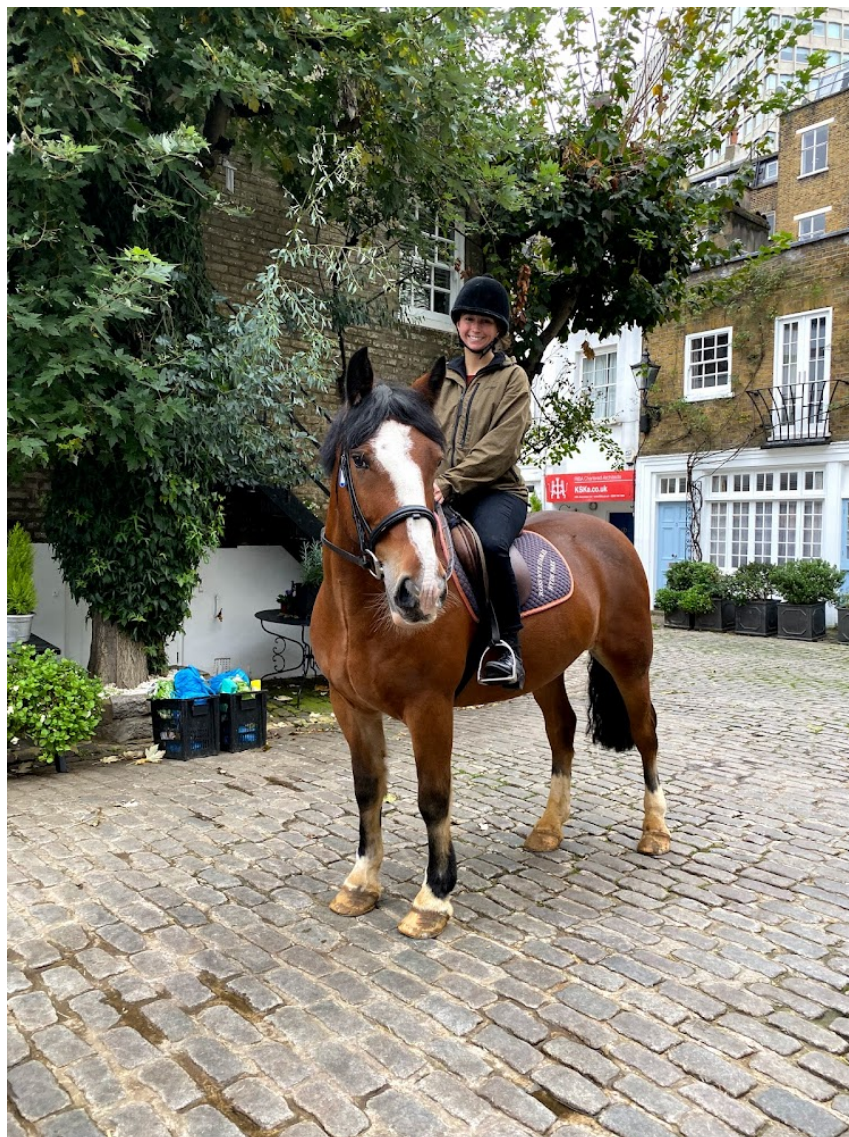
Figure 14. Horseback ride through Hyde Park on the final day of the exchange program.