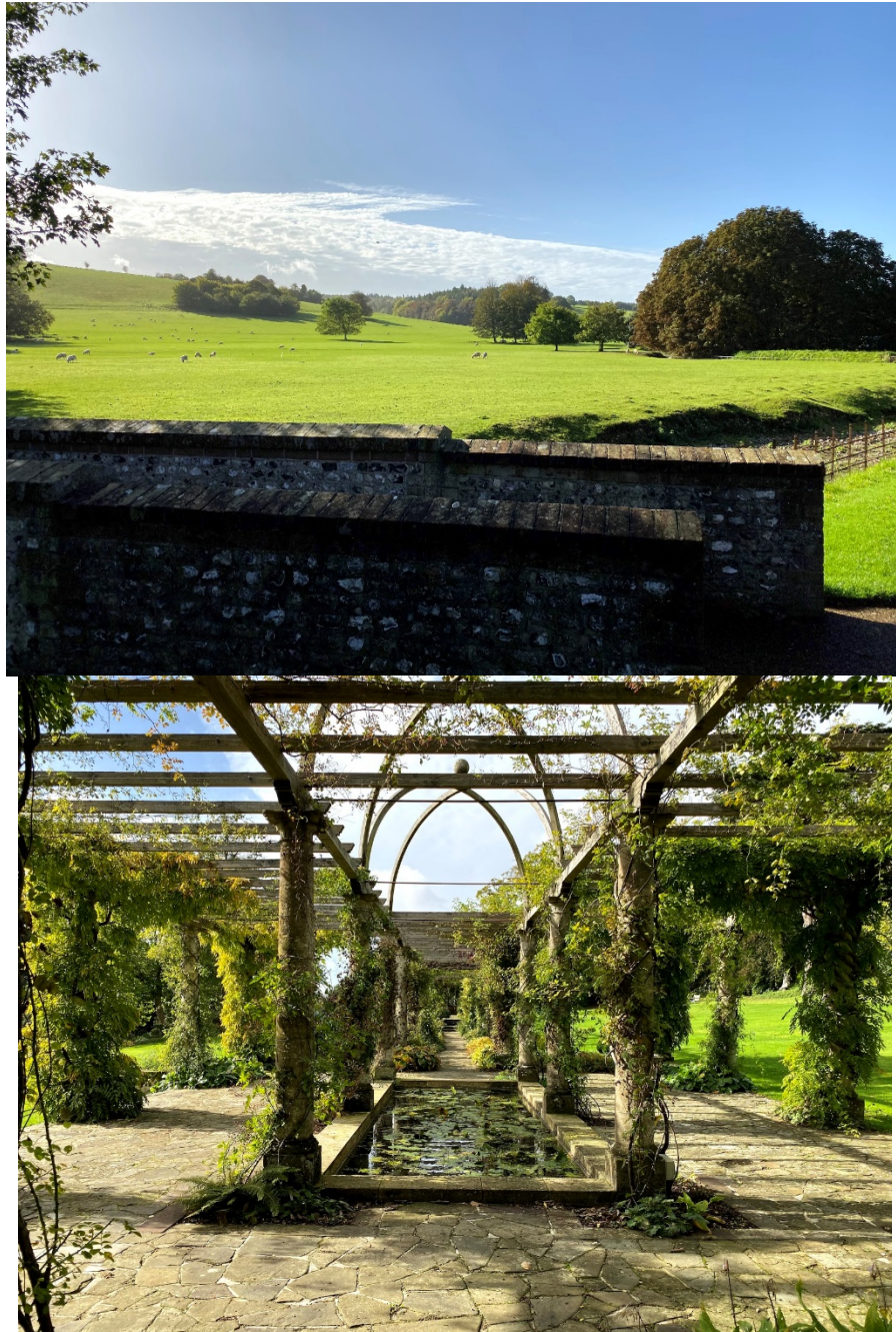
Figure 6. Sheep grazing in the Parkland at West Dean Gardens (top); the 300-foot Edwardian Pergola at West Dean Gardens (bottom).