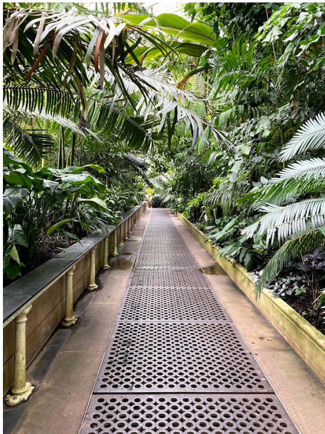
Figure 12. The exterior (top) and interior (bottom) of the iconic Palm House at Kew.