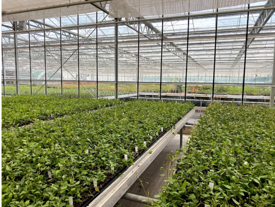
Figure 7. New Leaf, specialist producers of Clematis and climbing plants.