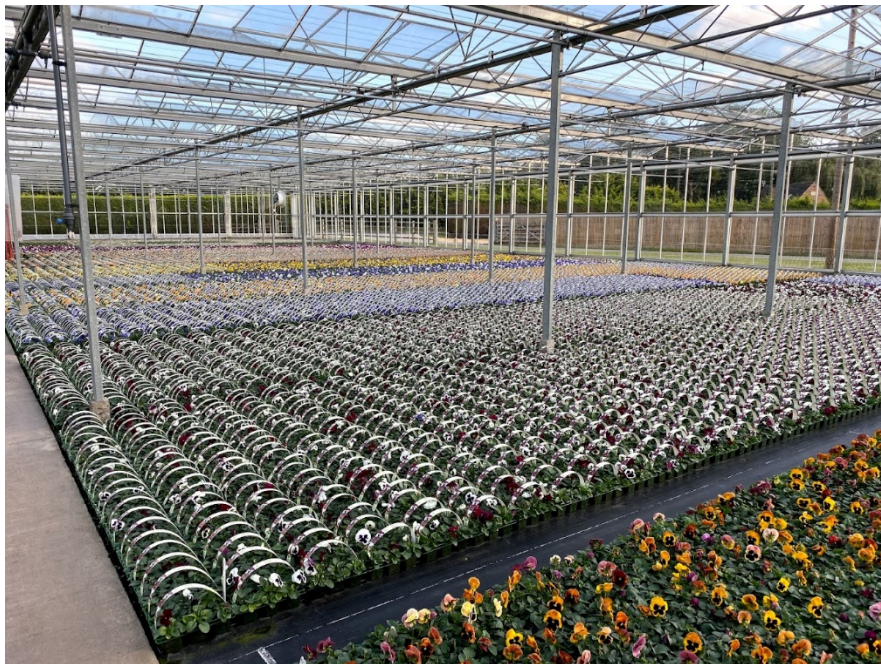
Figure 8. A glasshouse of pansies at Newey Avoncross.