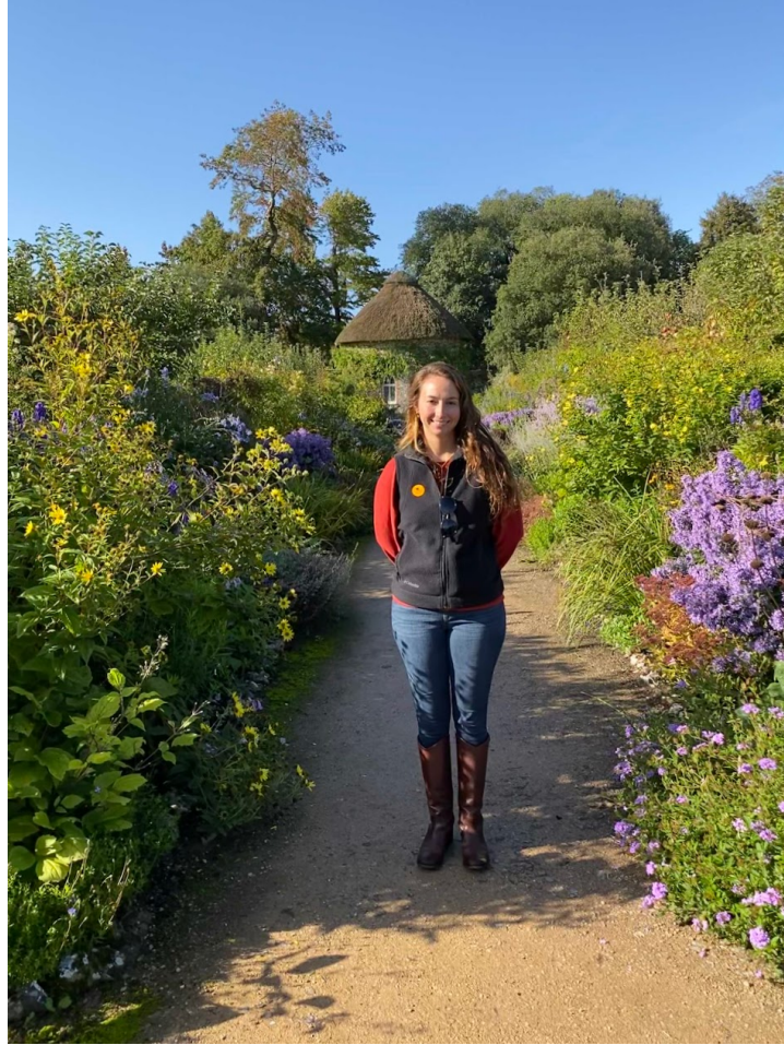
Figure 5. Part of the Walled Garden at West Dean Gardens.