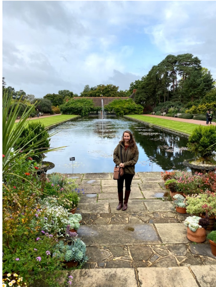
Figure 3. Visiting the Royal Horticultural Society's Wisley Garden.