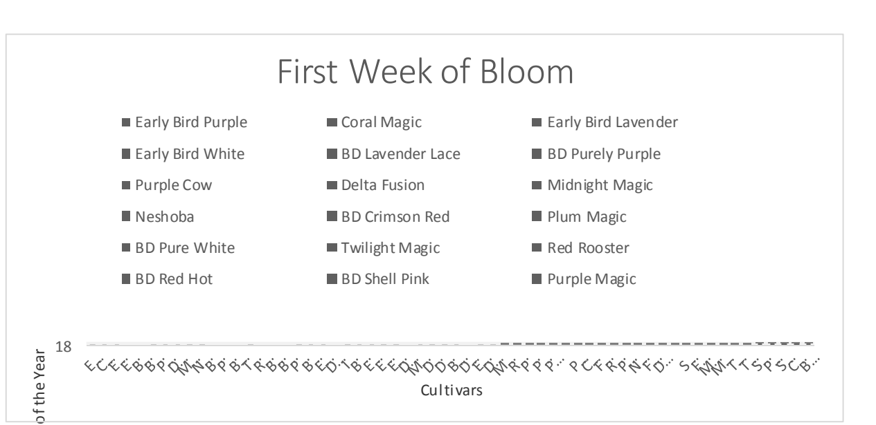
Figure 2. First week of blooming of 60 new crapemyrtle cultivars popular in the ornamental trade. Not all cultivars were listed due to limited space.