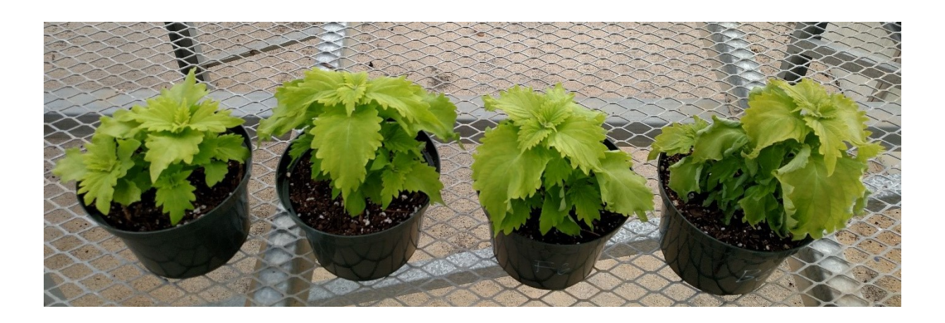
Fig. 2. Visual drought rating. 0 = no wilt; 1 = minor wilt (1-2 leaves); 2 = moderate wilt (3-5 leaves); 3 = heavy wilt (majority of leaves).