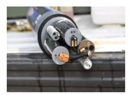
Fig. 1. A multiprobe Sonde set to continuously monitor water quality