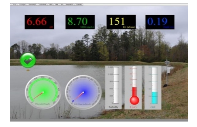
Fig. 2. Real-time data communication via a telemetry system and Verizon satellites