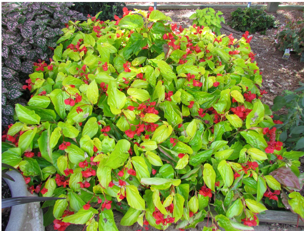
Figure 1. Begonia 'Canary Wings' - Ball Ingenuity.