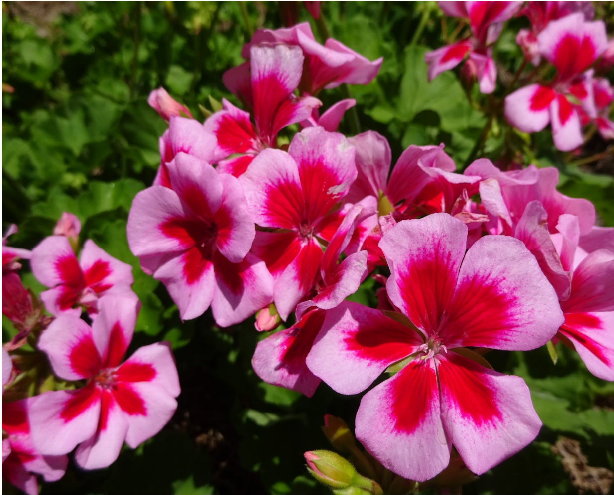
Figure 8. Pelargonium Calliope® ‘Large Rose Mega Splash’ - Syngenta Flowers.