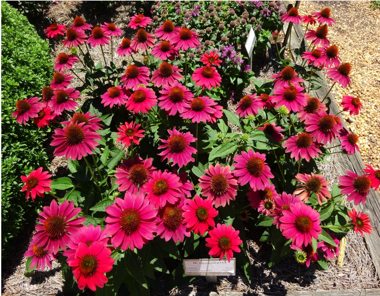
Figure 4. Echinacea Sombrero® 'Tres Amigos' - Darwin Perennials.