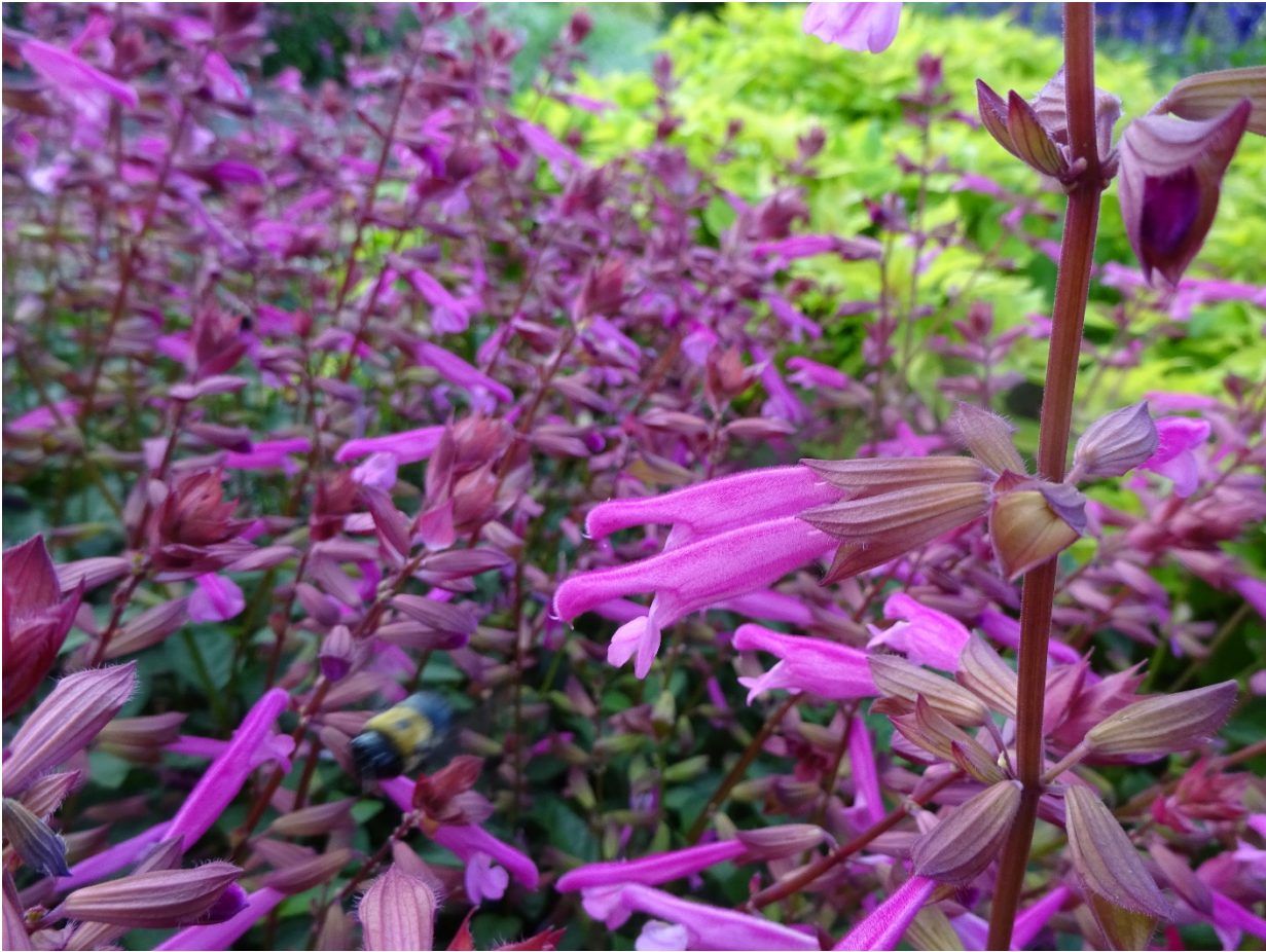
Figure 11. Salvia Skyscraper™ 'Pink' – Selecta.