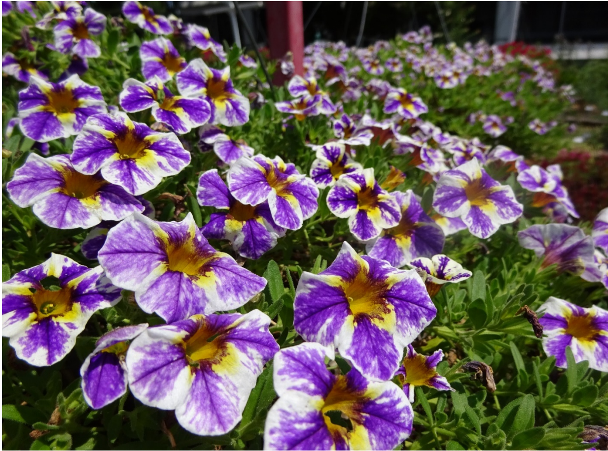
Figure 2. Calibrachoa Superbells® 'Holy Smokes!' - Proven Winners