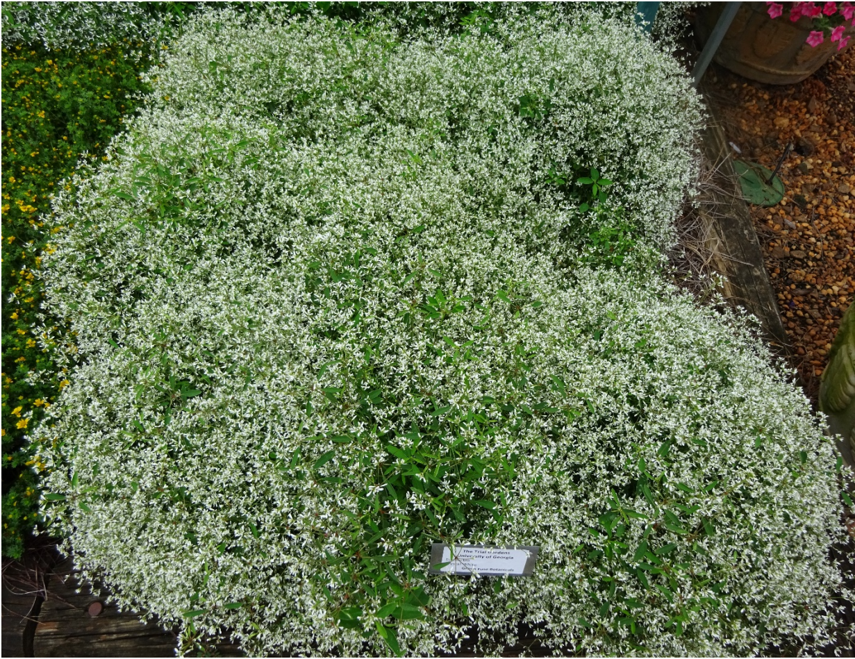
Figure 5. Euphorbia Crystal White™ - Green Fuse Botanicals.