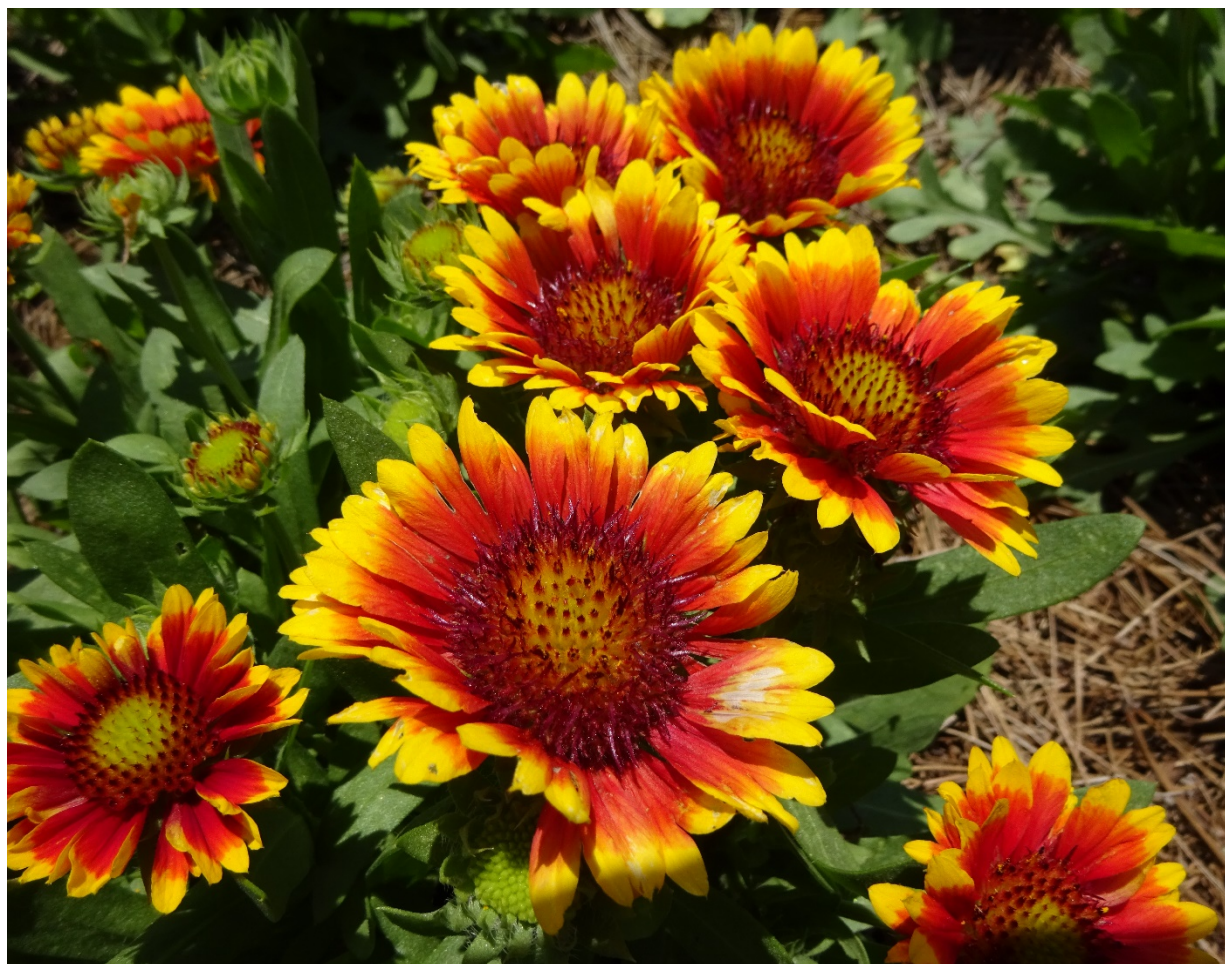
Figure 6. Gaillardia SpinTop™ 'Red Starburst' - Dummen Orange.