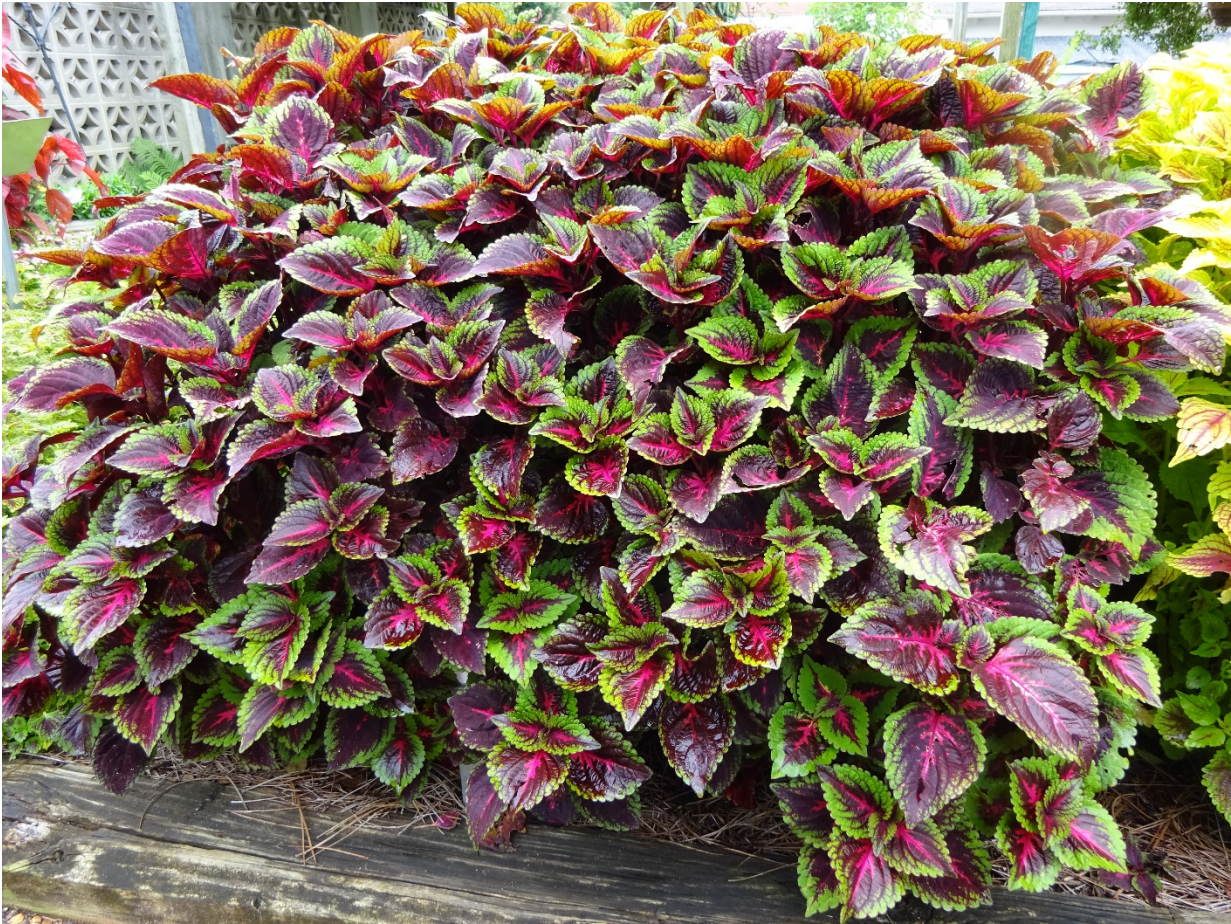
Figure 12. Solenostemon ColorBlaze® 'Torchlight' - Proven Winners.