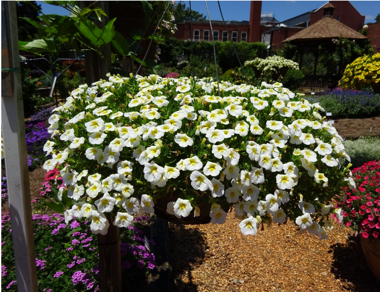
Figure 3. Calibrachoa Lia™ 'White' – Danziger.