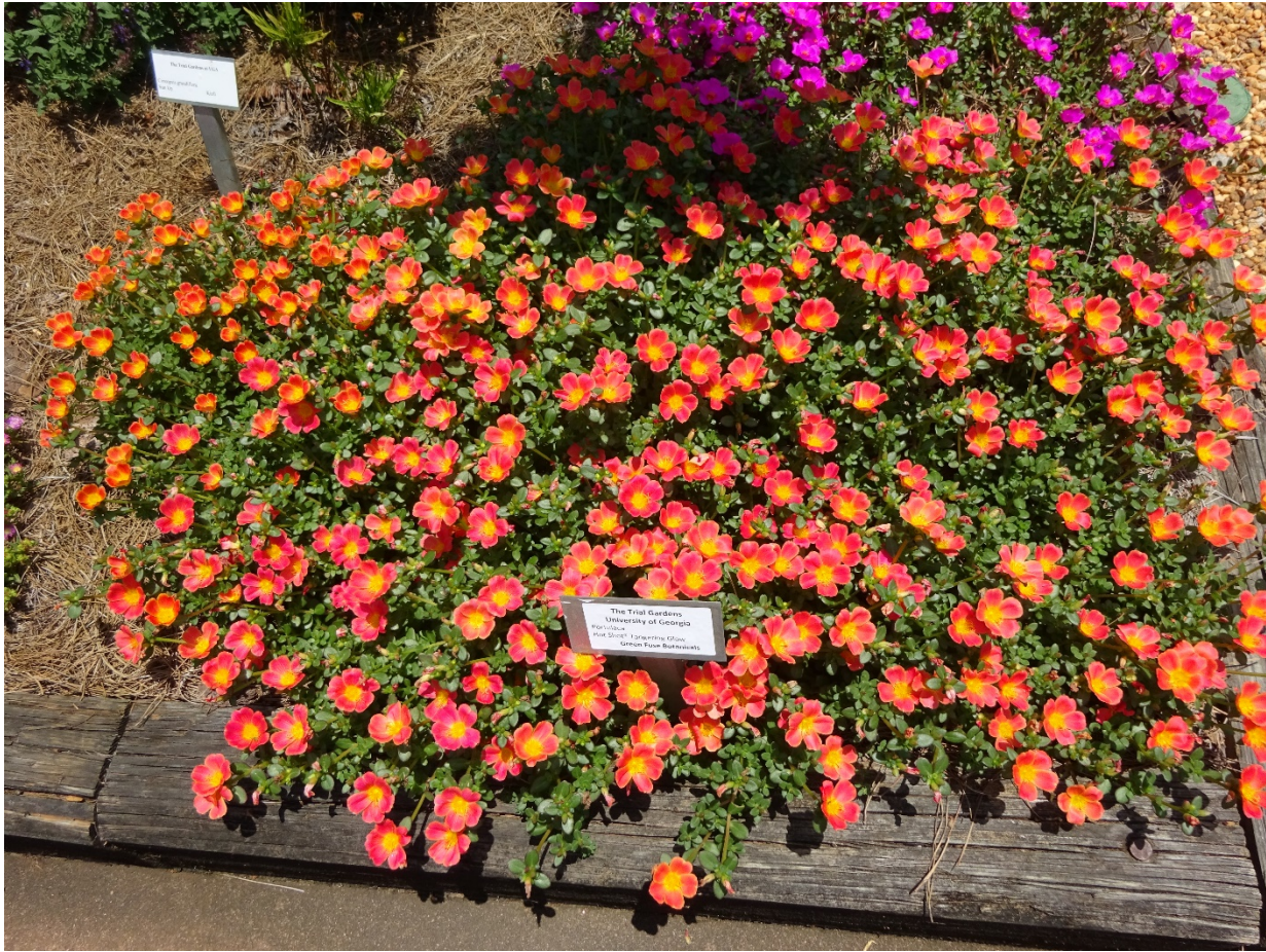
Figure 10. Portulaca Hot Shots™ 'Tangerine Glow' - Green Fuse Botanicals.