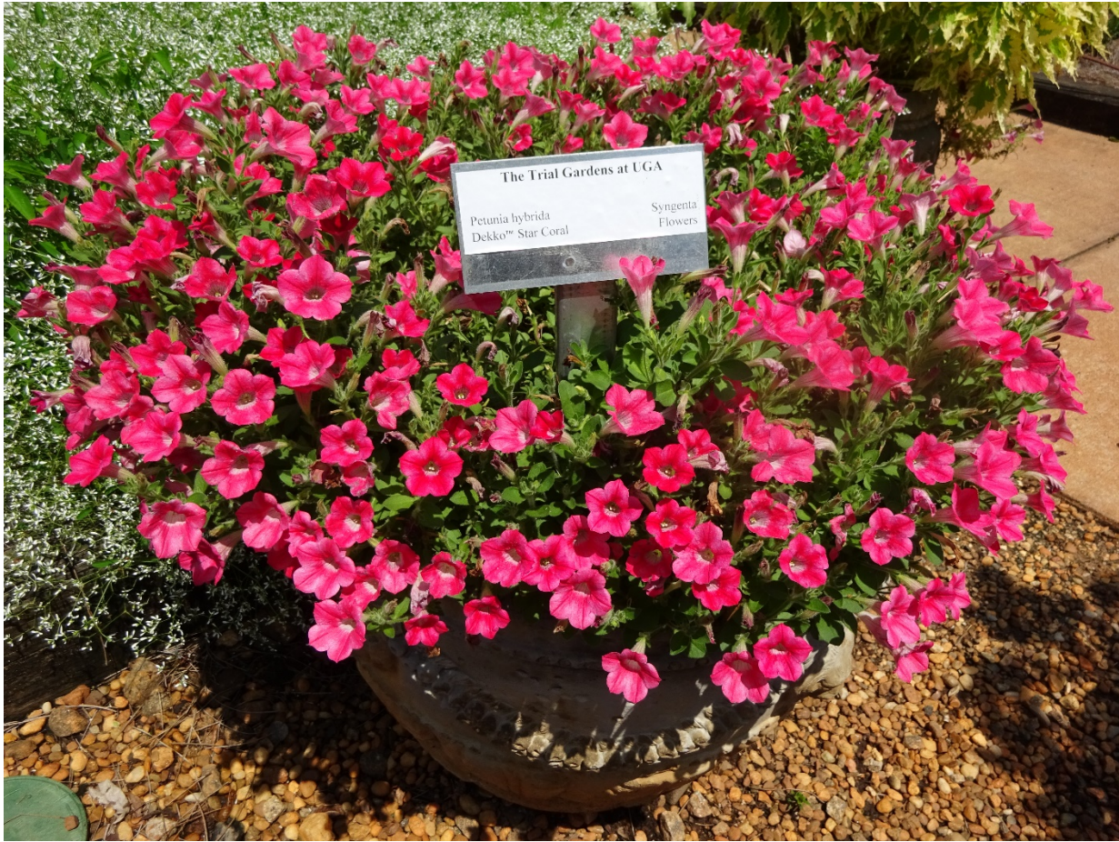
Figure 9. Petunia Dekko™ 'Star Coral' - Syngenta Flowers.